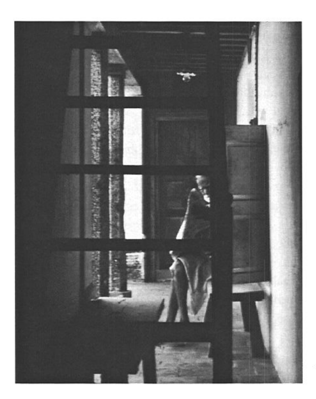
Fig. 5. Old and young read newspapers in Kerala. NNA outside his pattāyappura in 1983.

rate and infant mortality rate (17 boys and 16 girls die per 1000 live births), and women's high life expectancy (74 years) are other indicators of women's high social status. Kerala men also have a relatively high life expectancy (69 years). (Mathew 1995: 203; Ramachandran 1995: 18-19, 40.)