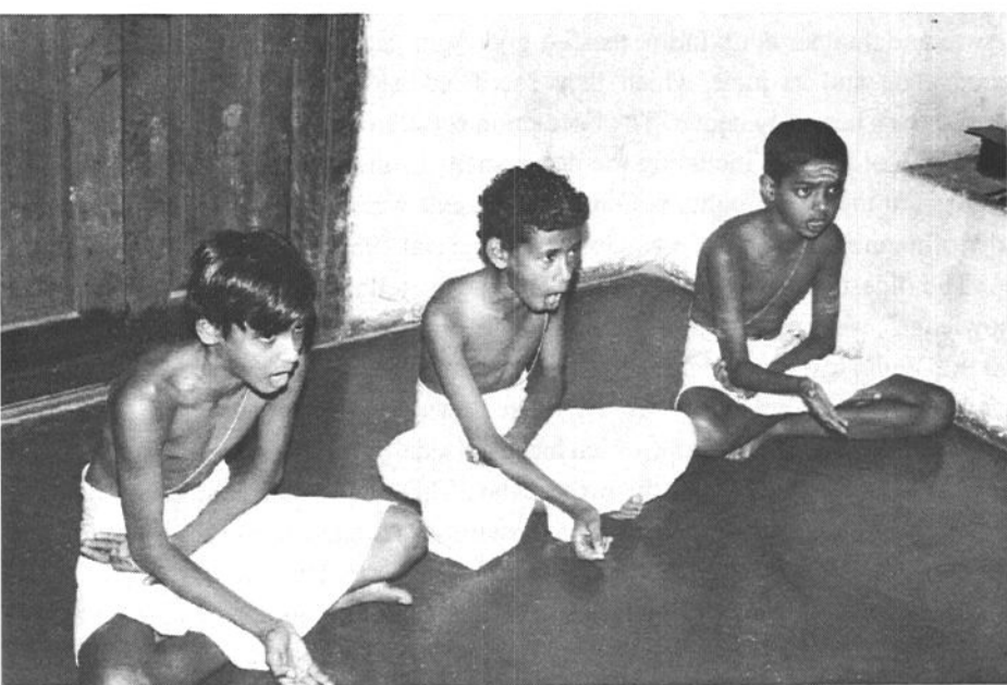
Figs. 2.-3. Nampūtiri boys being taught Sāmavedic chant in Panjal in 1985. The head and hand postures and movements accompany musical phrases and have the function of controlling and maintaining the correctness of oral tradition.