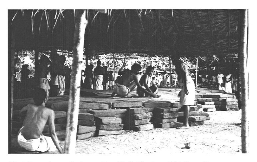
Fig. 4. The agnicayana ritual was performed in Panjal as late as 1975.

about Brahman, the Ultimate Reality or the Universal Soul, and its identity with each individual soul have little to do with the polytheistic folk religion with its colourful cults of myriads of deities. In addition to the approaches to salvation by the path of duty, karma-mārga , and the path of knowledge, jñāna-mārga , there is a third path. This is the bhakti-mārga , through the belief in and devotion to a personal saviour. (Cf., e.g., Brockington 1981.)