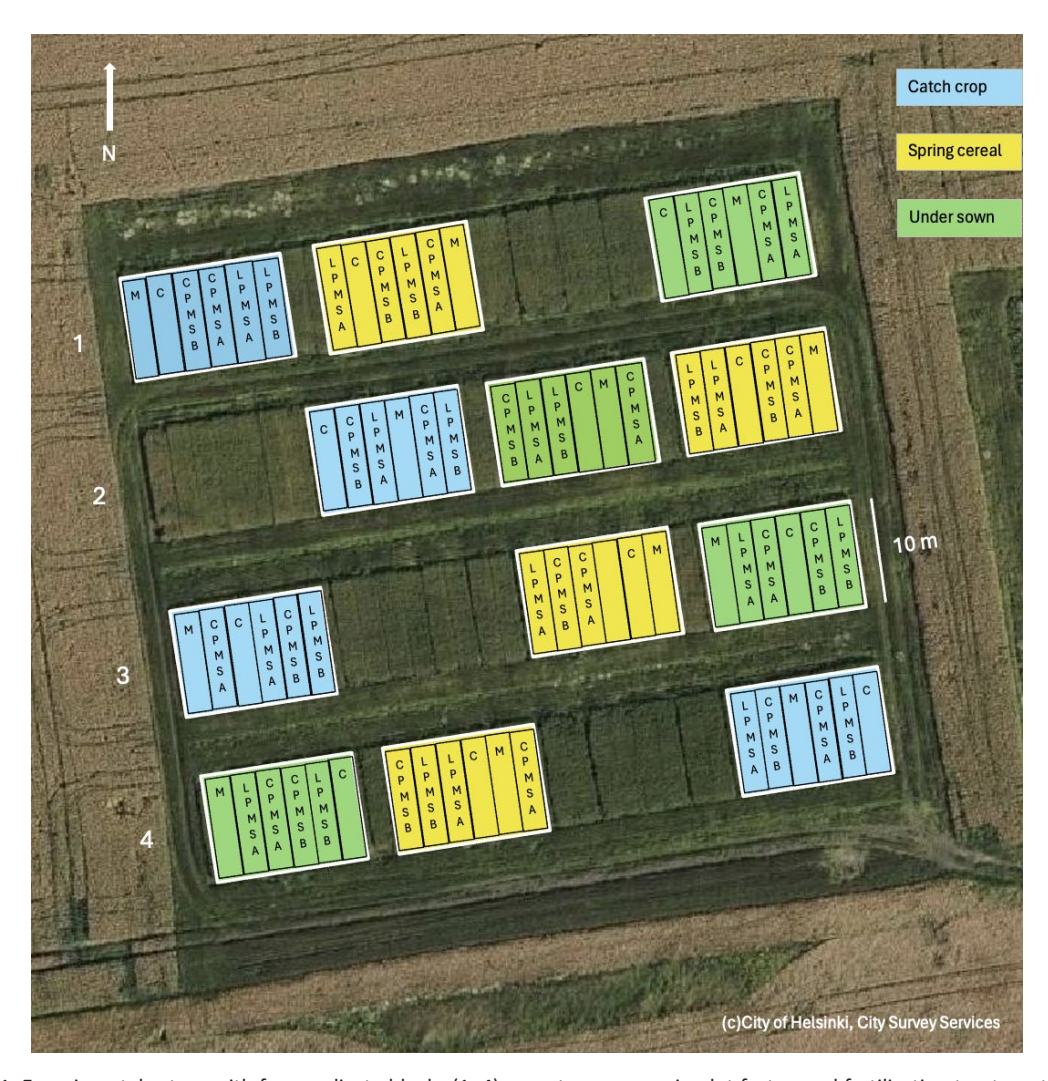
Fig. 1. Experimental set-up with four replicate blocks (1–4), crop type as a main plot factor, and fertilisation treatment as a subplot factor. CPMS = composted pulp mill sludge, LPMS = lime-stabilised pulp mill sludge, A = Stora Enso Imatra mill, B = UPM Lappeenranta mill, C= Control, no fertilisation, M = Mineral fertiliser. Catch crop = catch crop Italian ryegrass after spring cereal, Spring cereal = spring cereal alone, Under sown = spring cereal undersown with Italian ryegrass

The field experiment was a factorial design with crop type as the main plot factor and fertiliser treatment as the subplot factor (Fig. 1). The three levels of the main plot factor were spring cereals alone, spring cereals undersown with Italian ryegrass ( Lolium multiflorum , variety 'Meroa,' Departement voor lantengenetica en veredeling, Melle, Belgium) and Italian ryegrass as a catch crop (Fig. 1).