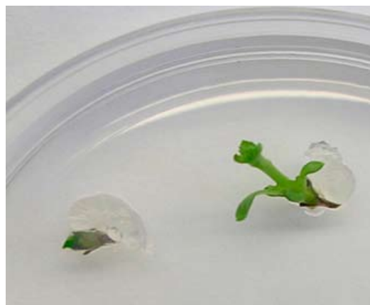
Fig. 1. Wild pear shoots encapsulated in alginate beads and recovered after cryopreservation.

SSR marker amplification was performed using 19 primers that produced 57 reproducible fragments (Table 3). Fragments ranged from 60 to 600