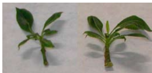
Fig. 2. Wild pear shoot, 30 days after recovery from cryopreservation (left) and mother plant shoot

base pairs; the highest number of analyzable bands was obtained with the primer pair NH020 (six fragments), the minimum with primer pair NB103 (one fragment). A summary of the results of RAPD and SSR marker analysis is given in Tables 2 and 3. The total number of fragments scored for the whole plant material analysed was 1056 (66 fragments