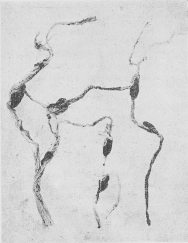
Fig. 3. Sclerotinia borealis in winter rye. \times 2 .

Kuva 3. Sclerotinia borealis syysrukiissa. \times 2 .