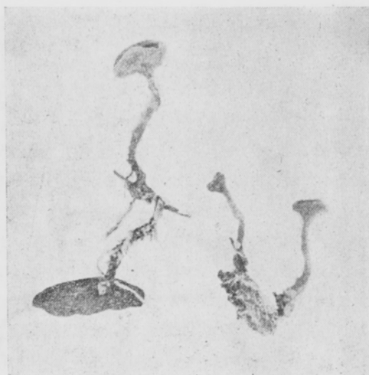
Fig. 1. Sclerotia of Sclerotinia borealis with apothecia. \times 3 .

Kuva 2. Sclerotinia borealisen harventamaa timoteita.