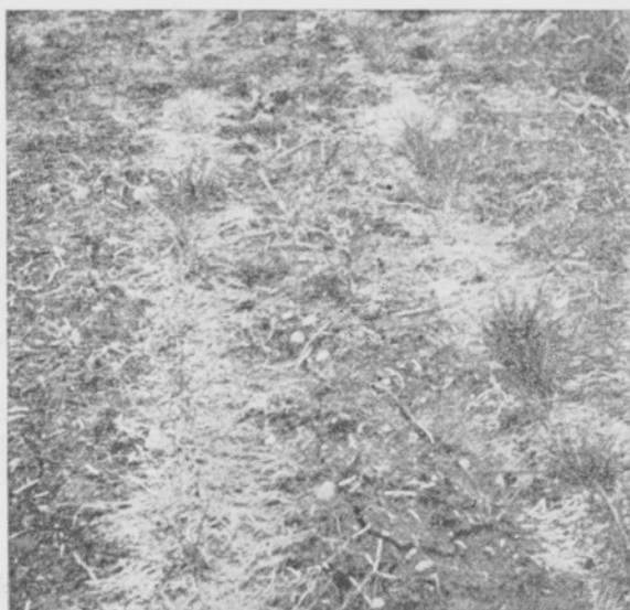
Fig. 5. English rye-grass damaged by Sclerotinia borealis . Photographed in spring 1948 at Porsögården, Branch Station of the Swedish Seed Association near Boden. —

S. borealis had in most cases entirely damaged the plants it had infected. The