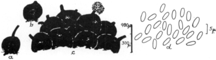
Fig. 3. Plenodomus meliloti . a, b = single pycnidia; c = pycnidia cluster; d = conidiospores. Drawings made from 65-day old culture on Henneberg agar.

of the pycnidia varied from 500 to 800 \mu . There were generally several spore chambers and apertures in each pycnidium so that the pycnidia cluster as a whole contained relatively many apertures. These were located either directly on the surface of the pycnidia or on the tubular, slightly curved terminal elongation formed by them. Conidiospores were produced on very short, unbranched conidiophores located in the spore chambers of the pycnidia. About 60—80 days after the culture growth had terminated, the spores were to flow from the apertures as a yellow secretion. The spores were colorless, single-celled and elongated ( 4.5\text{--}6.5 \times 2.0\text{--}3.3 \mu ; average 5.29 \times 2.59 \mu ; Fig. 3, d).