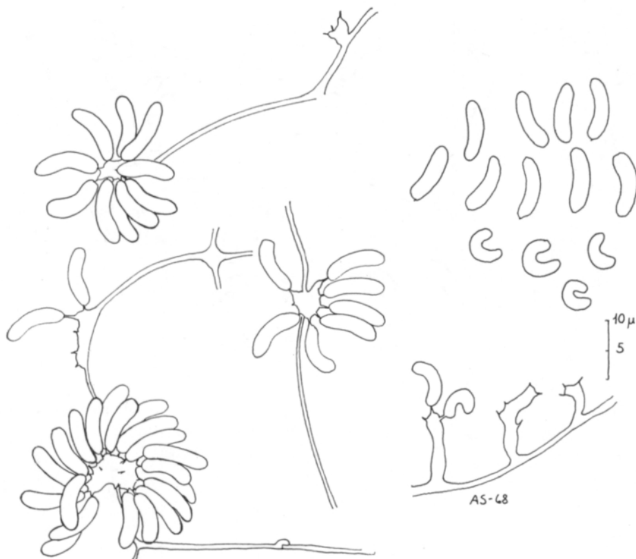
Fig. 1. Nematoctonus robustus Jones. Mycelium with clamp-connections and conidiophores with conidia, 60 days old CMA-culture.

N. robustus has been found in Ghana, Africa, in leaf mould composts already in 1958, although the description by JONES was published only in 1964. Further information on the occurrence of the fungus has not been found in the literature.