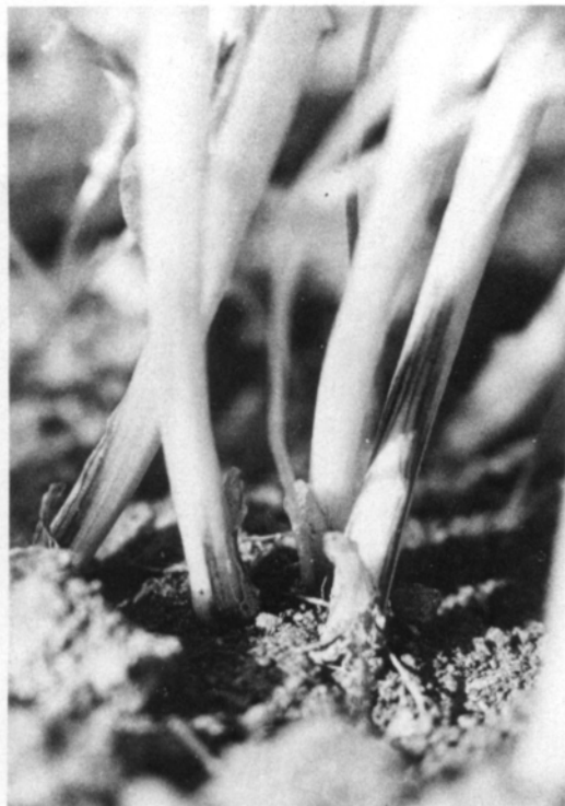
Fig. 2. Foot rot symptoms at the time of heading.