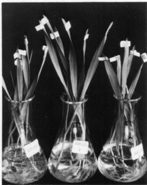
Fig. 3. Leaf dip senescence and root discoloration caused by toxic metabolites of Bipolaris sorokiniana .

tionally dry conditions (Fig. 2). Barley cultivars, which were found susceptible in pot experiments were also susceptible in the field but no data is presented because of the uneven distribution of the fungus in the field soil.