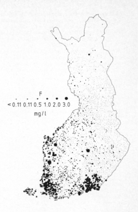
Fig. 2. The content of fluoride in Finnish groundwater according to the investigation of the Geological Survey of Finland (Vuorinen et al. 1986).

A mixed sample of Finnish honey was analysed in connection with the investigation