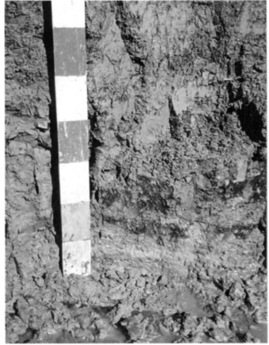
Fig. 3. The Ylistaro pedon from 0.80 m below.

originally in the soil or formed upon drying and partial oxidation of sulfide, probably results in a slight overestimation of CEC and underestimation of base saturation in the most acid ( \text{pH} < 3.5 ) horizons and in the horizons containing sulfidic materials. Possible presence of free sulphate salts also adds to the overestimation of CEC. Poorly crystalline Fe and Al (hydr)oxides were extracted with 0.2 M \text{NH}_4 -oxalate ( \text{pH} 3.0 ) in the dark (McKeague and Day 1966). Iron and Al were determined by ICP.