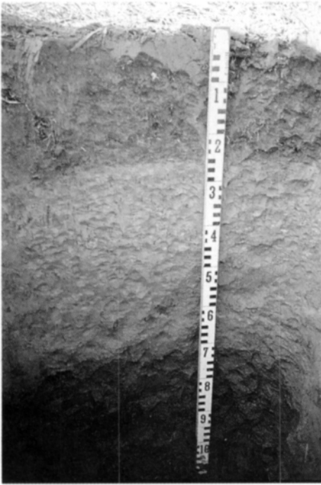
Fig. 2. The Liminka 1 pedon.