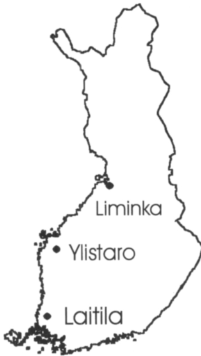
Fig. 1. Locations of the pedons.

fore sampling. At the same time, the sampled plot was pipe-drained to the depth of 113 cm and limed (15 tons dolomitic limestone ha -1 ). Oats had been grown in the field for three years, after which cropping was abandoned and the area was now covered with a grassy vegetation. Ground water was at 95 cm below the soil surface on August 14, 1992.