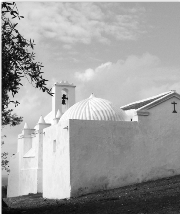
São Brás, Serpa, Portugal.

diseases. This hypothesis is supported by the similarity that the artifacts have with offerings made to Saint Lucy – patron of the blind and those with eye problems – and also by the fact that in Garvão, Saint Lucy was adopted as the region’s patron Saint (and