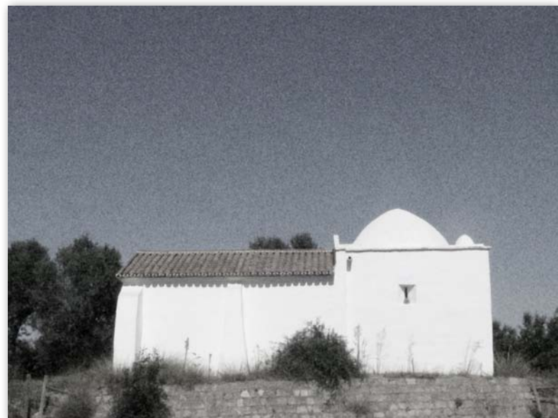
São Vicente, Ferreira do Alentejo, Portugal.

The plans of Santa Luzia, São Vicente, São Sixto and São Sebastião have the exact measurements of the so-called Portuguese Andalusian cubit, which may lead to the conclusion that these examples were built by Muslims or Moorish architects between the eleventh and twelfth centuries AD.