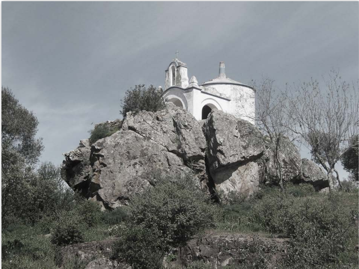
São Lourenço do Olival, Portel, Portugal.

Although the original use of these buildings is still debatable, the majority of researchers argue that the cubas were sanctuaries that housed the remains of a Muslim saint, thus immortalizing and perpetuating his symbolic power (Gonçalves 1964: 12). However, the clear tie that exists between the cubas and the surrounding landscape has raised many doubts and also led to many hasty conclusions. For example, the historian Artur Goulart Borges sees the location of these structures – at the top of the highest mountains in southern Portugal – as a functional alliance between places of worship and military surveillance (Borges 1985: 199–200). According to Jorge Feio, some cubas are located on the official administrative borders of the Alvito County, which can be seen as evidence that