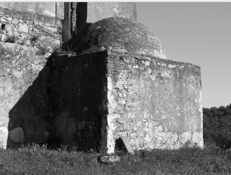
São Pedro, Vila Nova da Baronia, Portugal.

versies surrounding the cubas , since those places can be interpreted as symbolic sites where the Earth is closer to Heaven, or can be seen as territorial boundary markers, or even as viewing stations for the surrounding landscape.