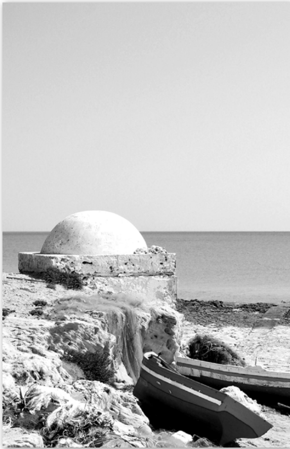
Sidi Meer, Zarzis, Tunisia.

In Alentejo, the buildings that present a squared plan and a dome are popularly referred to as ‘ cuba type constructions’. This is an interesting expression that not only denotes the typological idea that is popularly connected to the Arabic cubas , but also reveals that this type of construction was common in the region, an architectural reference known by many, one that has endured until today.