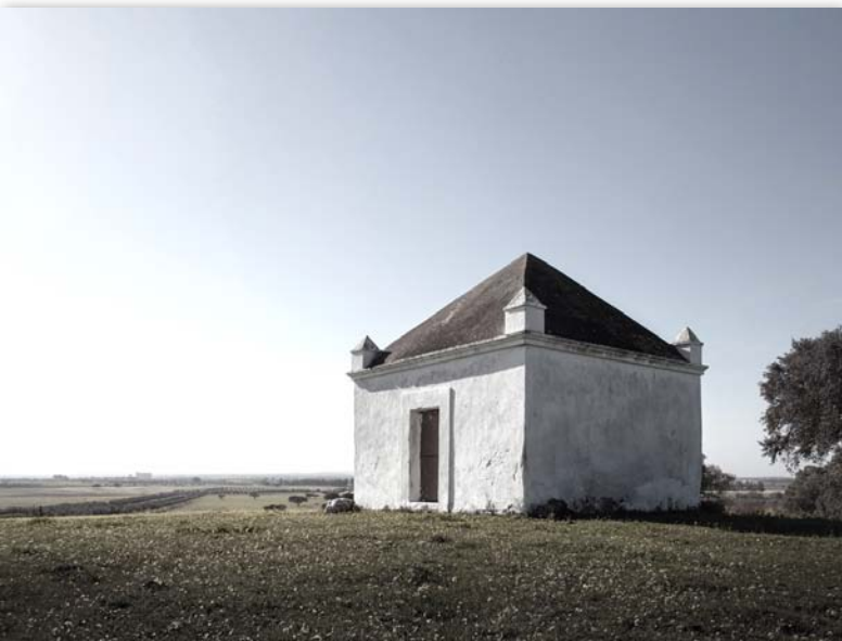
São Sixto, Cuba, Portugal.