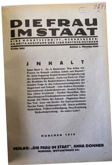
Die Frau im Staat , 1919.

Steiner was aware of Eisner and respected him, even sending him a personal copy of his Philosophie der Freiheit ( Philosophy of Freedom ) early on in 1893 (Steiner 1987b, 194–95), a book Steiner