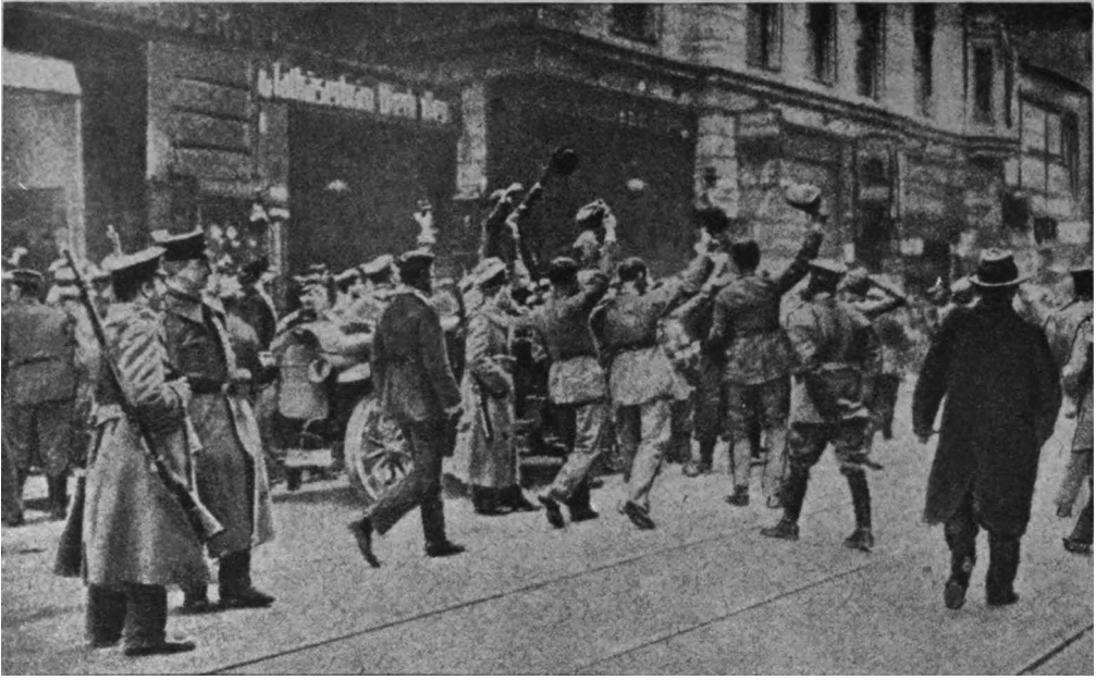
Revolution in Munich, 1918.

considered his most prized philosophical work. He even suggested Eisner as a potential “workers’ leader” ( Arbeiterführer ) for his social three-folding movement (Boos 1972, 226). On 8 November 1918, when Eisner proclaimed the Bavarian Council Republic, there was an attempt on the same day to arrange a meeting between Eisner and Steiner (from the side of the three-folding movement); however, this unfortunately was not realized (Wiesberger 1969, 14). The meeting only took place later, when Steiner attended the Arbeiter- und Sozialistenkonferenz der Zweiten Internationale in Bern and discussed with Eisner the question of German guilt ( Schuldfrage ) following the war (Wiesberger 1969, 23–24; Lindenberg 1997, 652). After learning of Eisner’s assassination only a few days after this meeting, Steiner referred to his death as a tragedy (Steiner 1989, 84).