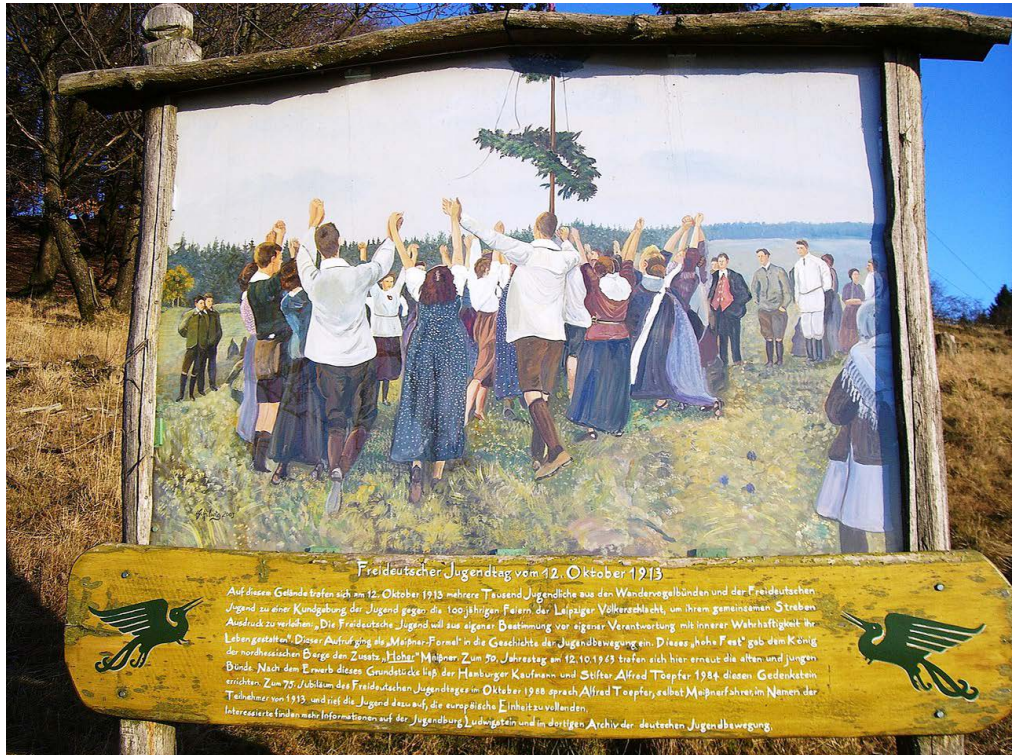
Free German Youth Day, 1913.

Jörg Holzmüller, 2006. Wikimedia Commons (CC BY-SA 2.0).