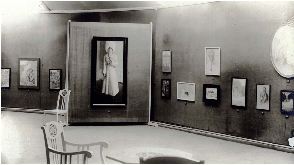
Uno Donner's exhibition in gallery Strindberg in Helsinki in October 1915.

praises were addressed to Gunnel Wahlfors, the painter who worked as the director in the plays, but Olly's contribution as a scriptwriter was also acknowledged. The plays were said to have the appropriate humour, morals and atmosphere, to be artistically of a very high level and 'picturesque and able to address the mind of a child' ( Hufvudstadsbladet 21.4.1941; Svenska Pressen 29.12.1941; Hufvudstadsbladet 29.12.1941). Olly also composed songs for some of the plays, at least in 1941–2. In the few existing critical mentions, her melodies are said to be good, partly full of spirit, partly brisk ( Svenska Pressen 29.12.1941 and 19.1.1942). The Christmas plays were 'legend plays' made in the medieval spirit, and said to be joyful and even burlesque ( Svenska Pressen 29.12.1941; Nyland 30.12.1941). Although the critics hardly made the connection, these plays clearly did have a connection to Steiner's mystery dramas, which often are described as 'medieval mystery plays'.