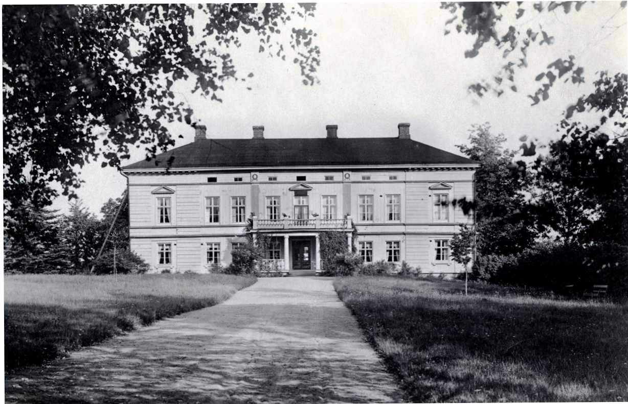
Gerknäs manor in Lohja, Finland.