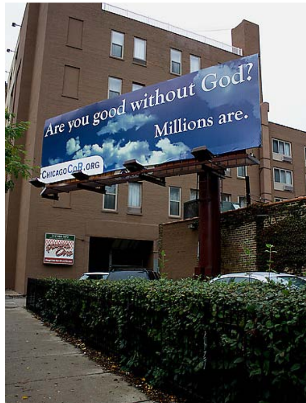
Atheist billboard in the USA.

I realise that I'm getting into this whole anti-religion thing. I don't know if my friends like this, but whenever I'm hanging out with them, I'm constantly talking about it ... how religion is hurting people, how people are so intolerant when they're so religious, and so on. I mean, I am pro-abortion, I'm pro-homosexuality, and I participate in the parades and everything. ... When people ask me, I tell them I'm atheist. I tell them why and things like that – there were just so many unanswered questions. I wouldn't understand why if there was a God, why there would be so much suffering among the most innocent and the most poorest people, you know? I must tell you when I let go of religion, one thing I felt was relief. I feel a profound sense of relief. I don't have any more unanswered questions. I know there's science to explain it and everything makes sense to me now. I can just live my life knowing I have control of my life. There is no afterlife. This is it, make the most