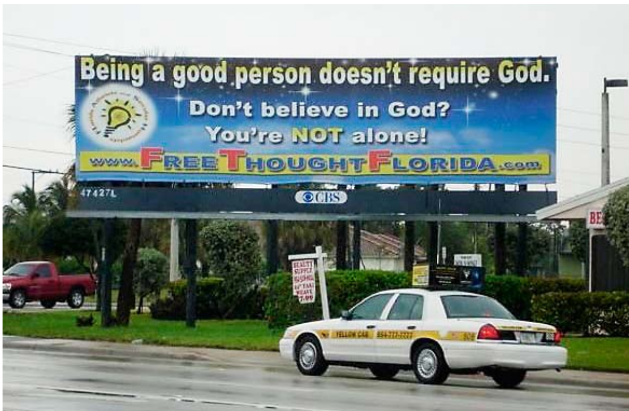
Atheist billboard in the USA.

In contrast, for most non-religious Americans, their apostasy was quite intense. It entailed a real personal struggle. It was a dramatic, life-changing experience that they recalled as being very significant and even painful. And unlike Scandinavians, Americans have a lot to say about it. They tend to talk about