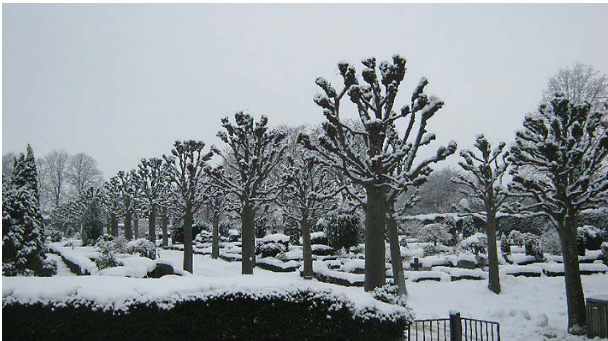
Graveyard in Aarhus, Denmark.

I don’t really think so much about it. So I wouldn’t know right now how to define it. But I believe in something. ... Well ... there’s more between heaven and earth ... you know? And there’s more than I can understand, but I don’t think it’s a big father sitting up in the sky watching us and helping us, or whatever. But there’s something ... maybe ... I don’t know.