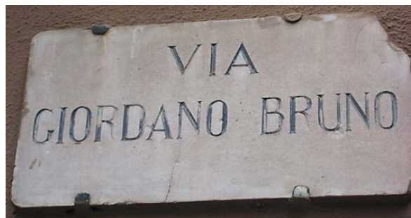
Via Giordano Bruno in Messina, Sicily. Giordano Bruno (1548–1600) was burnt at stake for his heretic views. Thousands of women who met the same fate have remained without statues or streets named after them.