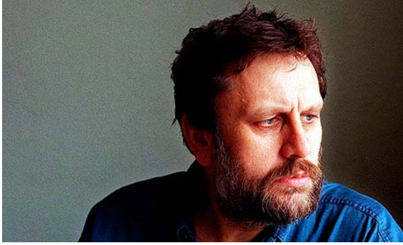
Slavoj Žižek.

‘projected’ by humanity. As an ‘excess’, it is something that exceeds our grasp or control.