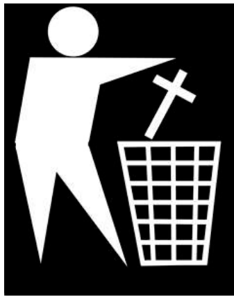
The atheists are not alone in their wish to do away with traditional Christian concepts.

Against the background of my idea of a common