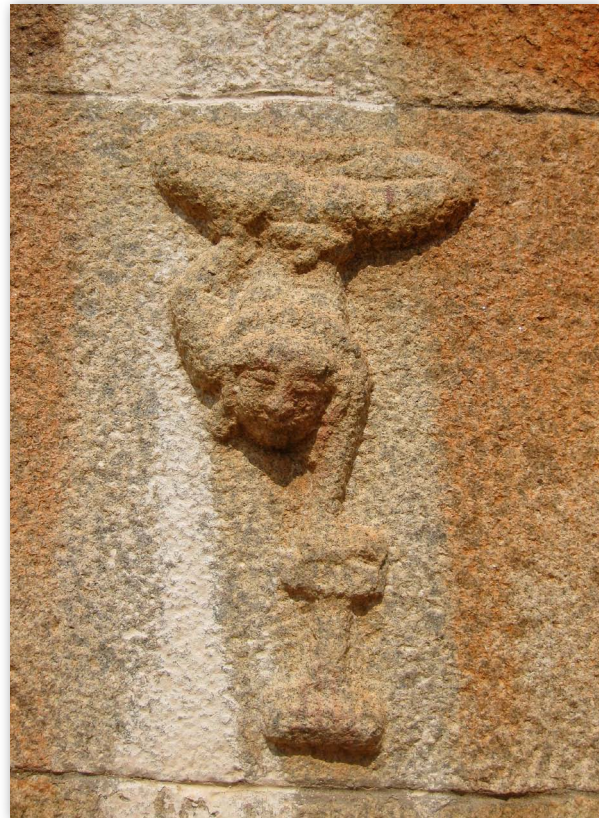
Mastering the body and physical empowerment.

. . .there are complex links between movement and affectivity that can be influenced by sustained involvement with MPY practices – though certainly in various ways and to different degrees.* In summary, then, postural practice in MPY may allow the practitioners to change his or her qualitative use of move-