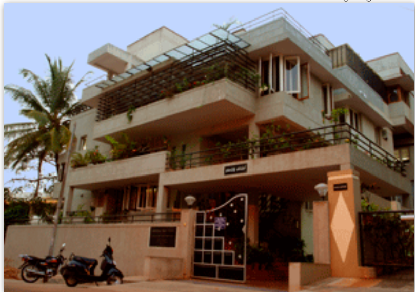
The shala in Mysore.