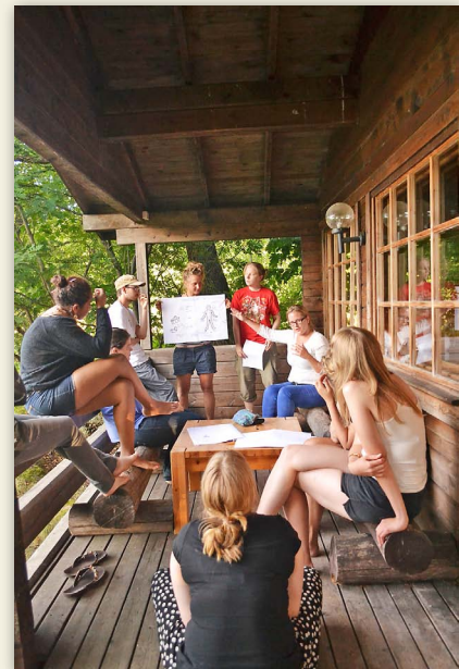
Poster presentation and feedback session.

This low-cost activity requires sheets of paper and markers for the creation of posters and usually takes 1h 30 min (each step 15 min, 10 min presentations and 15 min discussion).