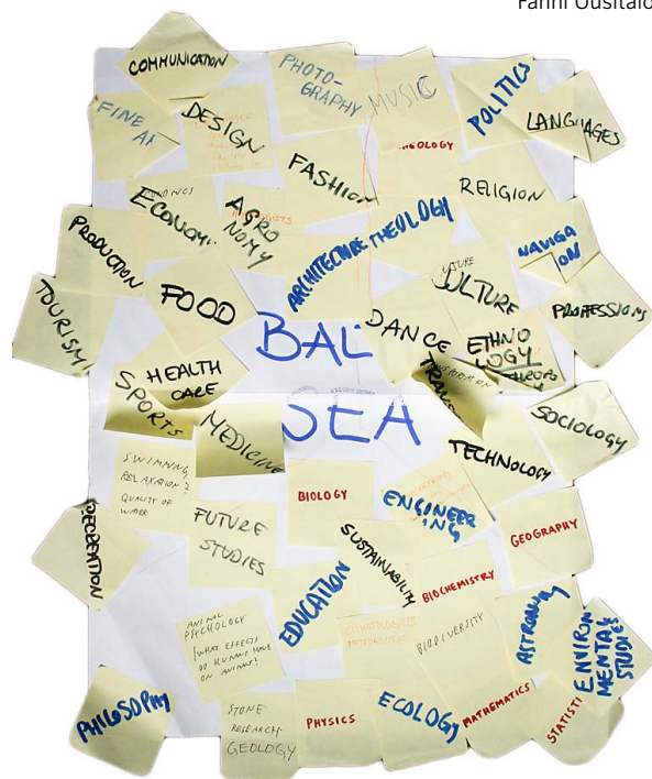
Results of a brainstorming session: disciplines and approaches that examine the Baltic Sea.

More information of the project proposals on the Mosaic of Life website.