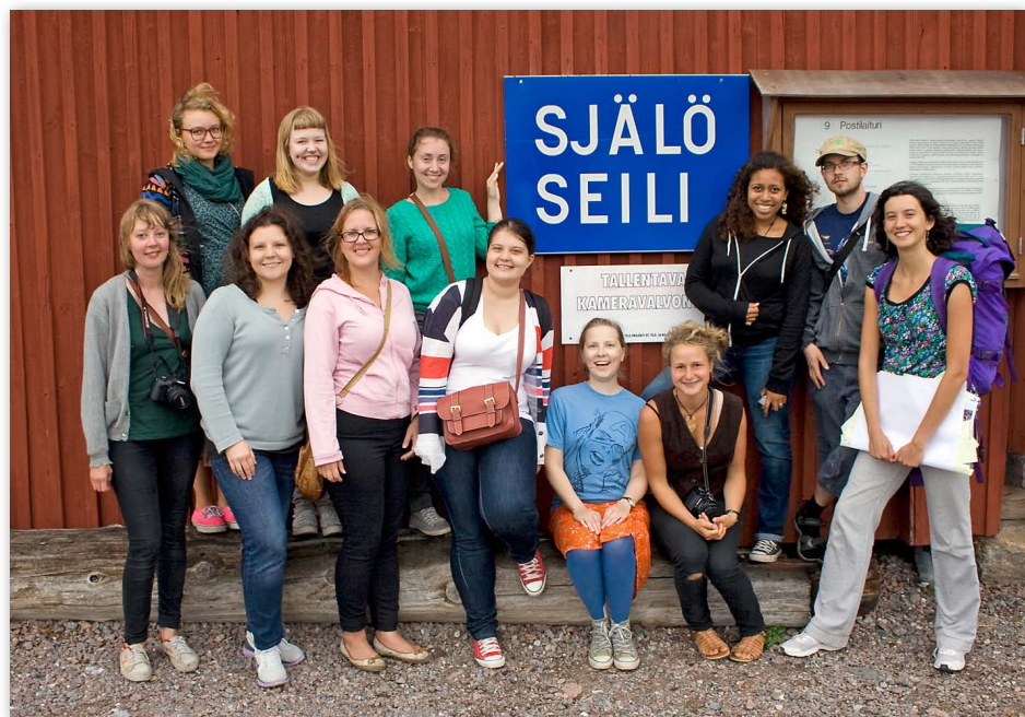
Participants in the Mosaic of Life workshop at Seili Island.

This five-day workshop was divided into a training phase (three days) and a project development phase (two days). The training phase consisted of several team-building and creativity exercises, performed in groups of various sizes, or individually. Methods included different forms of brainstorming, theatre improvisation, observation exercises and change in perspective exercises. The exercises were based on several established approaches, which were modified for the specific use in this workshop (for more information, please see the references below). Examples of two specially designed activities can be found in the Boxes 1 and 2. In addition to training sessions, the participants had the opportunity to interact with two guest speakers: the Director of the Archipelago Research Institute, Ilppo Vuorinen, and one of the coordinators of the Baltic University Programme Network (BUP), Ea Blomqvist; both researchers in marine biology. These meetings allowed the participants of the workshop to deepen their knowledge of marine biology, the Baltic Sea environment and sustainability. At the same time, the participants had the opportunity to be inspired by these passionate and interdisciplinary researchers.