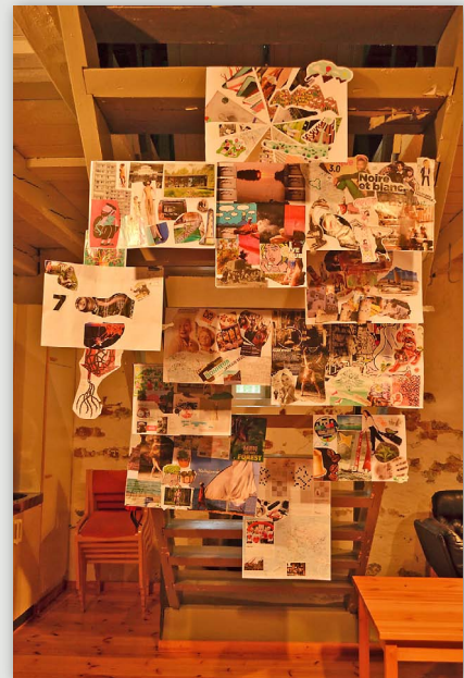
Introductory posters of all participants on display in the seminar room of Seili Island Marine Station.

This activity allows the participants to introduce themselves in an unconventional way. At the same time, it's an opportunity to exercise creativity, time-management and presentation skills. This short activity (45-90 min depending on the group size) requires very little preparation and easily available low-cost material (magazines, A3 paper, scissors and glue).