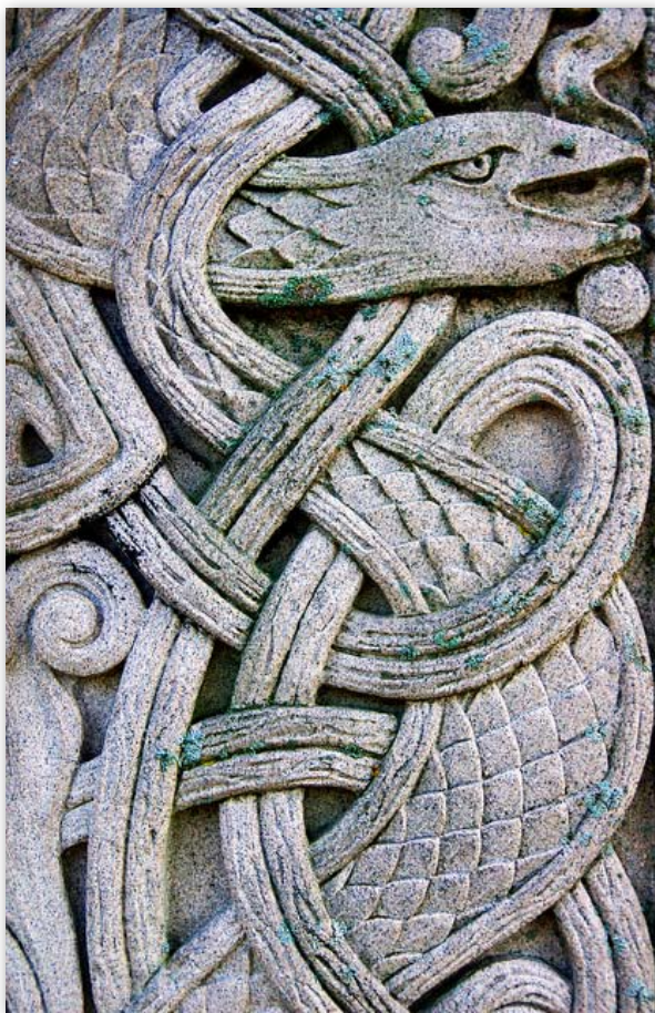
Celtic Knot Serpent. Photo by Wayne Wilkinson.

Creative Commons, Attribution 2.0 Generic