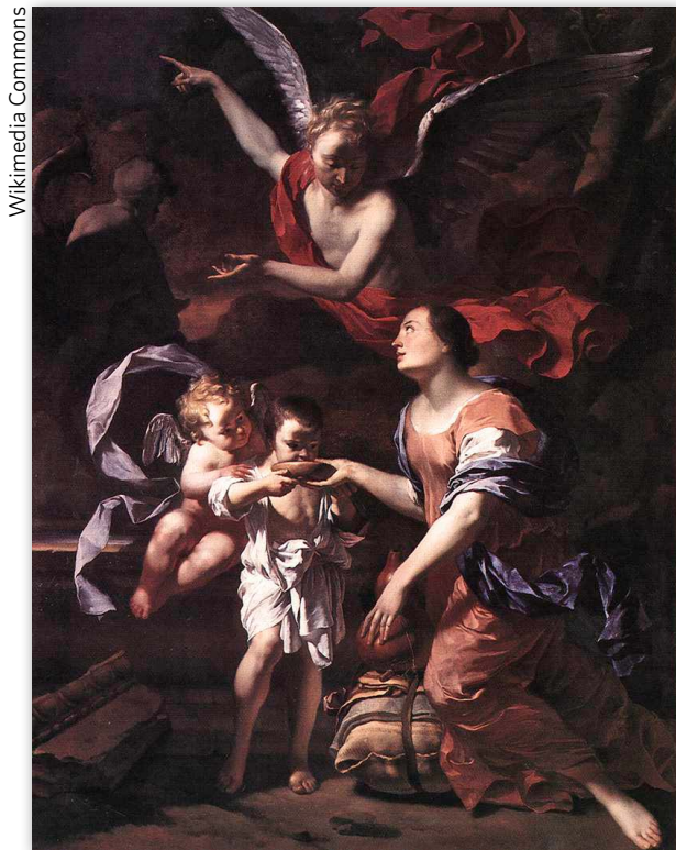
Karel Dujardin: Hagar and Ishmael in the Wilderness , c. 1662. Ringling Museum of Art, Sarasota.

The desert represents here this neutral ground, which precedes the need to choose, the need to struggle for a blessing. The rebellion against death does not appear in the name of the principle of individuation, but in