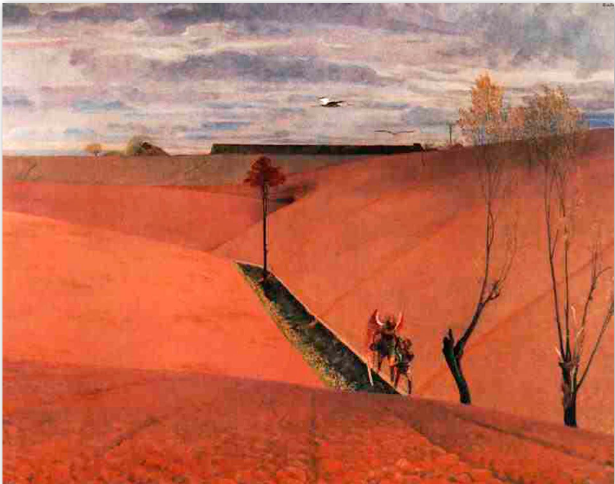
Jacek Malczewski: Paysage avec Tobias (printemps) , 1904. Museum of Poznan.

Invited by the Louvre Museum to create his own exposition, Derrida writes his Memoirs of the Blind . His clue-concept is blindness, but most of the chosen drawings, apart from some mythological themes, concern biblical figures. It is the old and blind Isaac, who before his death blesses Jacob instead of Esau, but also Tobias, who having lost his eyesight accuses his wife of stealing. In both cases, along with a disability – a physically conditioned loss of power – appears a rift for the implementation of a different plan. The plan of old Tobias, who was willing to