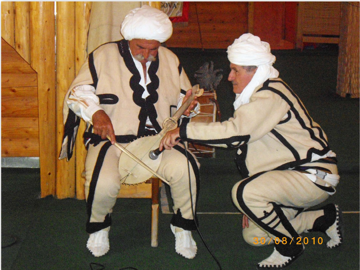
Albanian rhapsodist performing an epic song.