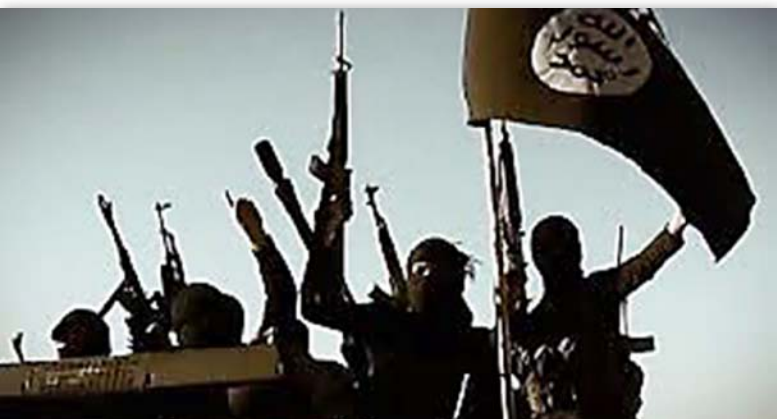
Islamic State in Iraq and al-Sham fighters.