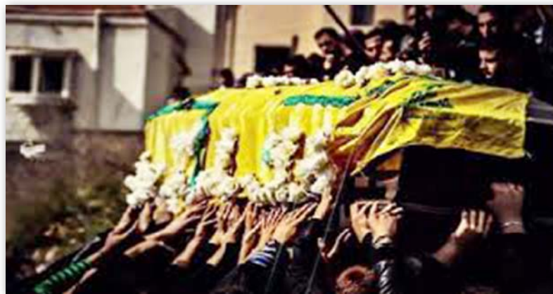
The funeral of a Hezbollah fighter.

The party officials further justified their party's position claiming that they wanted to avoid a similar scenario to what had happened in Iraq after 2006 when Shias were victims of sectarian violence, orchestrated by radical extremist groups (ICG 2014: 5).