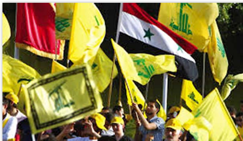
Hezbollah's Syrian Arab Republic's flags used by demonstrators to illustrate the alliance between the two.

To study the research problematic in the men-