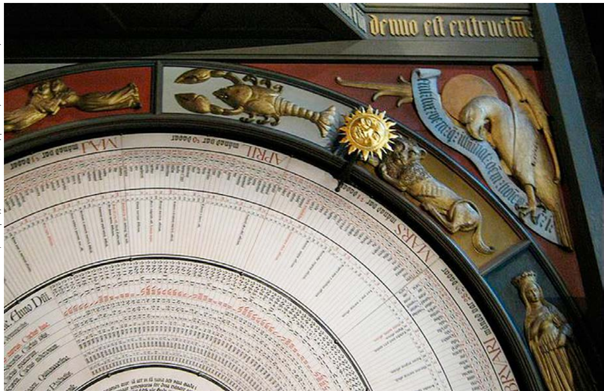
A detail of an astronomical clock, Lund Cathedral, Sweden.

Douglas Hofstadter (1979: 307) illustrates an