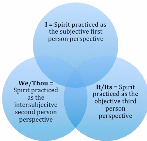
The Big Three of Spiritual Practice (adapted from Wilber 2006).

can be rigorously studied by means of experimenting with the practice.