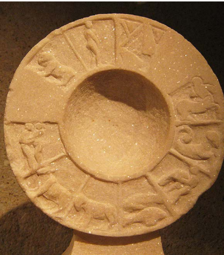
Neues Museum, Berlin.

world. Spirituality denies the flatland of materiality, acknowledges the depth of reality and sees the layers of reality (cf. Hill et al. 2000).