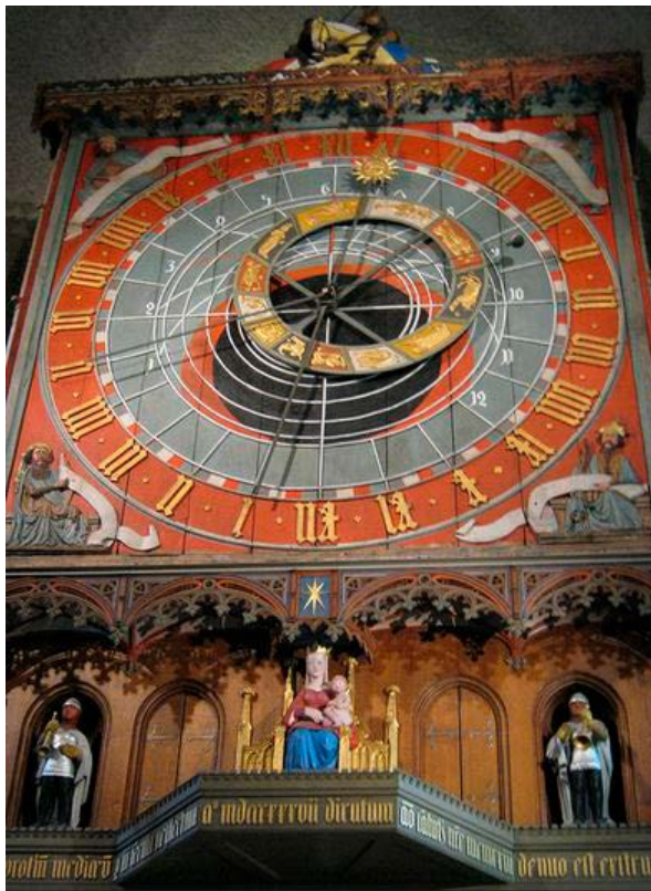
The astronomical clock (detail) at the Lund Cathedral, Sweden.

psychological tradition, the development of the self (or ego) is a lifelong process in which the person creates and defines his or her own limits and choices (Kegan 1982, 1994). At the same time and at many levels, cultural conceptions also play major role in individual development (Bronfenbrenner 1979).