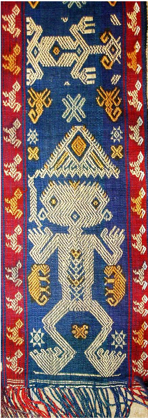
Front view of a detail from a textile from Sumba depicting an ancestor figure (Marapu) using a supplementary of the warp, 1899.

74–6). As we can see, the ideal of sincere speech amounts to a normative ideal of alignment between words and other outer things that emphasize the presence of inner ideals and beliefs over materiality.