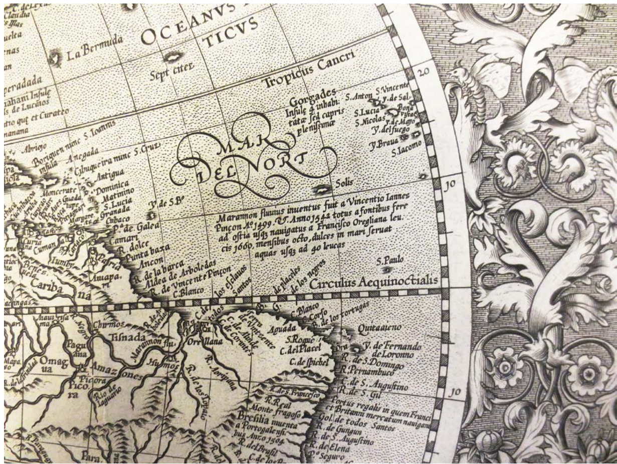
The Map of America celebrates Pinzón's Ninā.

the beginning of a new age. In his maps, Columbus and his crew are the only explorers who are referred to constantly.