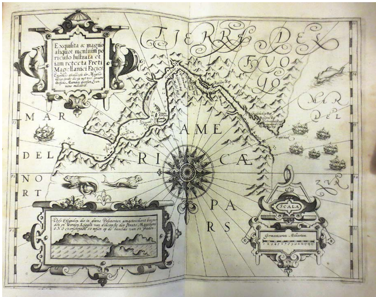
Fretum Magellanicum in the Mercator-Hondius Atlas.

British past and present. For Speed, Great Britain was a modern nation which had its roots in the medieval world. Both the Anglo-Saxons and the Normans had had a decisive role in the formation of the modern nation. While most of the maps described the current state of Great Britain, historical influences were constantly present (Speed 1611/12).