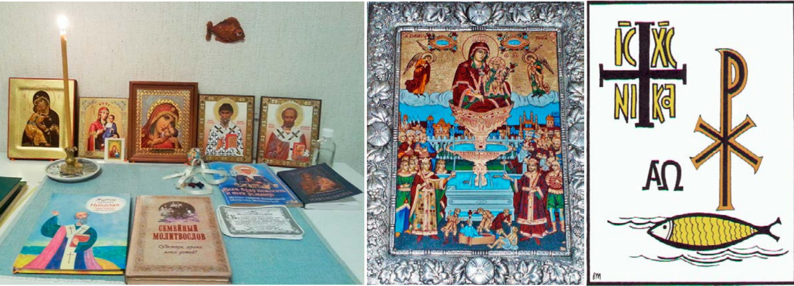
Figure 3 (left). Picture of a fish with an icon on a domestic altar, Finland. Figure 4a (middle). Zoodochos Pighi, Church of St Mary of the Spring (Istanbul). Figure 4b (right). Orthodox Church of America website.

The double fish symbol is – less commonly known – also prevalent in the Islamic tradition, for instance on a coin struck by the Mughal emperor Jahangir in seventeenth century India (Figure 5).