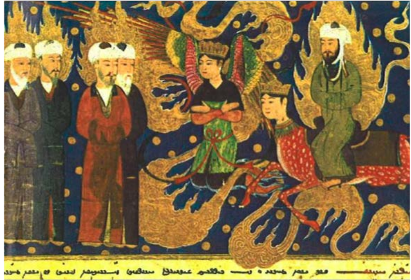
Figure 1a (left). Maryam and Isa. Persian miniature (nd). Figure 1b (right). The Prophet Muhammad meets the prophets Is'mail, Is'haaq and Luut on his Mi'raj night journey, Apocalypse of Muhammad (1436, Herat).

vsechelovecheskie ). ‘The more ontological the spiritual comprehension, the more naturally it is received as something very familiar, longed for by all human consciousness’ (Florensky 1993: 69). ‘All-human canons’ can be roughly compared with archetypes, which icons are supposed to capture, while the figures in the icons can be seen as the inhabitants of the realm of the imaginal.