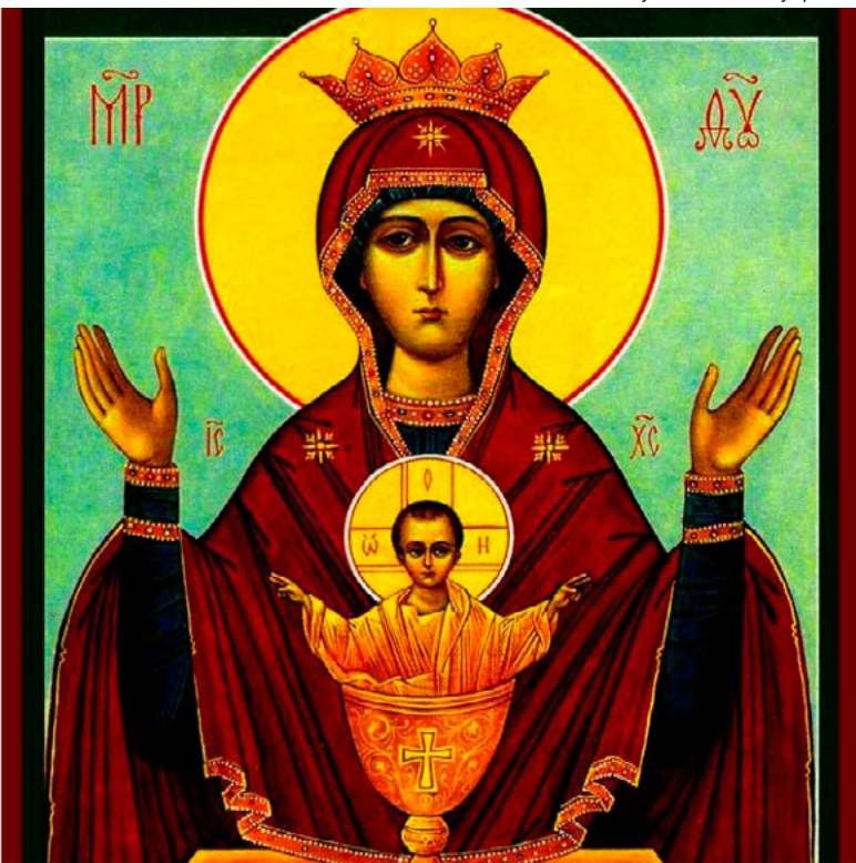
Figure 8. Orthodox icon of Theotokos 'Inexhaustible Cup'.

wine in the Eucharist, is the quintessence of the Divine Liturgy. The bread and wine are not meant to symbolize , but rather are mystically transfigured to become the body and the blood of Christ (Merras 1992). The chalice is not only a symbol, but archetypically emerges within the mystery of the liturgy, in which the border between the human and imaginal realms is transgressed. In this sense, the liturgical service is not intended to be externally symbolic (Meyendorff nd). As discussed, the mystical and the theological are on the same spectrum in the Orthodox tradition (Lossky 1976); the Divine Liturgy, too, is not only a memento of the Last Supper but its active reliving.