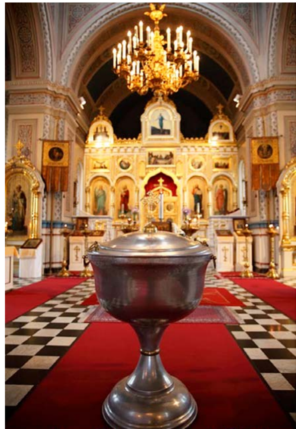
Figure 9. A chalice with holy water prepared in a Finnish Orthodox church.

To this, we can add the entire body of Sufi shrine music ( Qawwali ) from Central and South Asia in which the chalice appears ubiquitously as a carrier of divine wisdom (often wine). A curious example of this is found in the Shiite tradition of the Grail, a liturgical text used in ritual ceremonies in medieval Iran (Corbin 1998: 173–204). The ceremony –