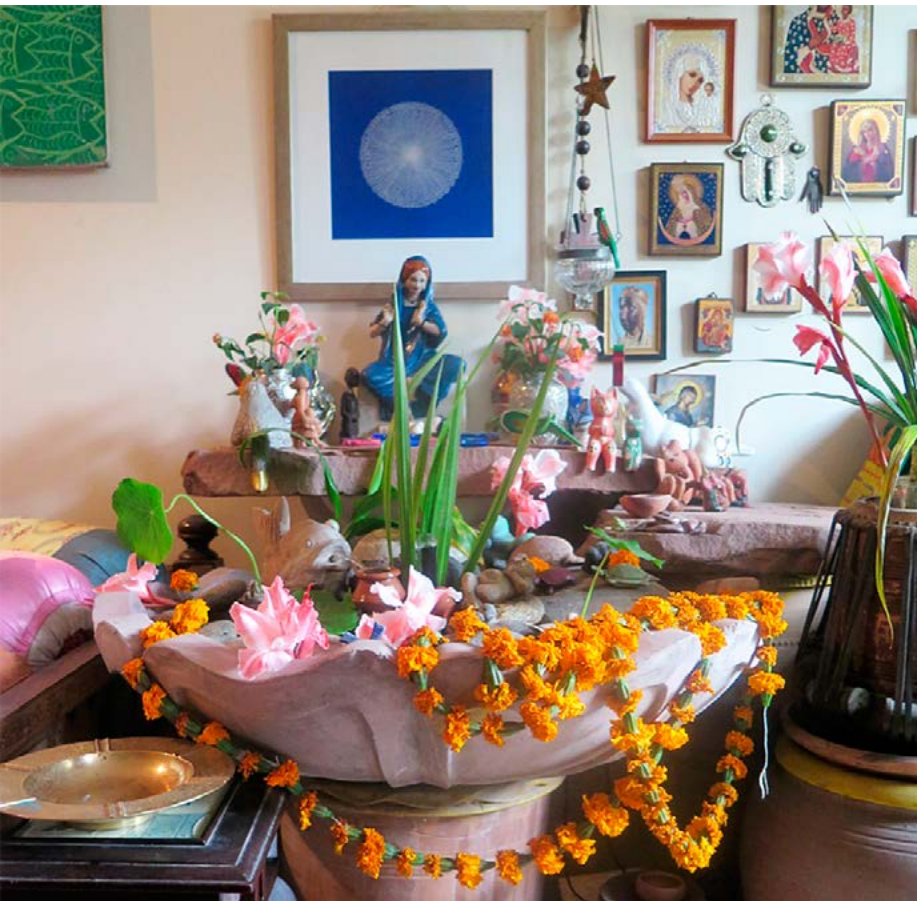
Figure 10. The domestic 'altar' of Laila, Lahore, Pakistan.

from most accounts in three ways. First, by drawing on post-Jungian archetypal psychology, such as that of James Hillman and Henry Corbin, as well as recent anthropological theories, we have described the prevalence of these symbols as being attributed to humankind's collective unconscious. This means that the symbols, in some sense, pre-exist actors: actors do not imagine them, but rather they can be seen as tapping into these symbols from the imaginal realm. Individuals in everyday life use these imaginal symbols to make sense of the world around them, in the same way that scholars use language to understand the world around them. Just as the physical or social world around us would make no sense without the language we use to describe it, so the spiritual world around us makes no sense without these archetypal images as building blocks. This leads to a somewhat neoplatonic ontology in which the ontic object is an instantiation of an archetypal symbol, and this is a charge Hillman and others have faced. However, archetypes are not mere ideal forms, but rather serve a function in the traveller's life-course.