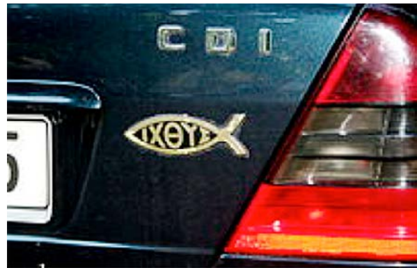
Figure 2. Fish symbol, 'Ichthys' ('fish' in classical Greek).

A peculiarity of the fish symbol is often its dual nature: in many cases, the common Christian symbol is of two fish, either crossing horizontally and vertically as in early pagan representation, or as circling each other. As Jung discusses at length (Jung, CW 9, part II: §162ff), the dual fish is a potent symbol, indicating at the same time the divine/human nature of Christ, but also his presence/future-return and,