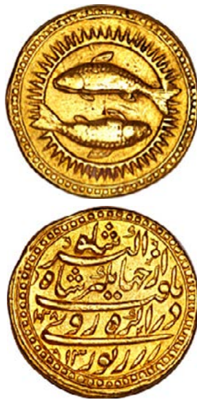
Figure 5. Picture of Islamic coins from Mughal dynasty, AD 1605–27.

mission and was then spat back whole when he submitted (Figure 7b). In fact, the ‘whale’ was traditionally depicted as a large fish in both traditions, often with scales, rather than as a mammal. Most classical and contemporary interpretations of the Quran translate the word huut in the story as ‘fish’ (S.37: 142).