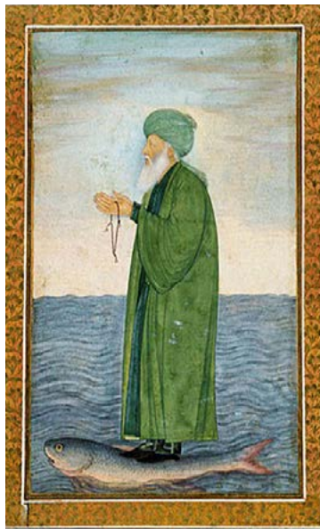
Figure 6a (left). The prophets Elias and Khidr at the fountain of life, late 15th century. Folio from a khamsa (quintet) by Nizami (d. 1209); Timurid period. Opaque watercolour and silver on paper. Herat, Afghanistan, at The Freer Gallery of Art, Smithsonian Institution. Figure 6b (right). The Prophet Khidr on a fish, Western Asia (nd).

traditions and in a variety of practices (although see Jung and Franz 1998).