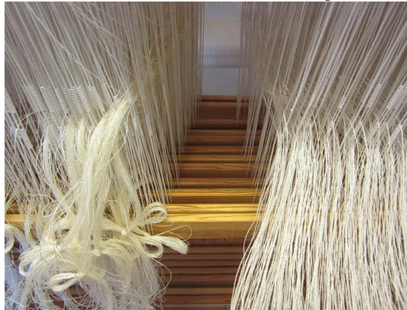
Fig. 8 (left). Pulling on the warp with weights. Fig. 9 (right). Hedding.

But we never dress the ordinary table. In English the expression ‘dress’ is connected to a variety of actions related to setting up, processing and preparation. It has constructive elements. So here it is appropriate to mention that the title for this paper: ‘Dressing the body’ is chosen using the word ‘dress’ in its widest sense and meaning.