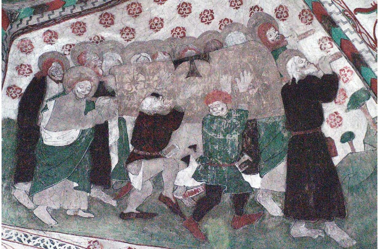
Fig. 2. Medieval church painting by Albertus Pictor in Kumla Church. digitalmuseum.se, identification number: DIGo25489.

The funeral pall as a part of Swedish funeral rituals has medieval roots; however, its function and use, as well as what it is an expression of in contemporary times, are really quite different from what they were in the past. We have very few of these textile objects, if any, remaining today. However, there are a number of descriptions painted on the walls of churches that can still be found (Fig. 2). What we see