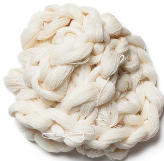
Fig. 7. The beginning; the warp.