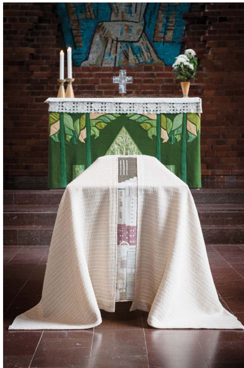
Fig. 15 (top). Detail of process. Fig. 16 (bottom). 'The Chronicle of Kortedala'.