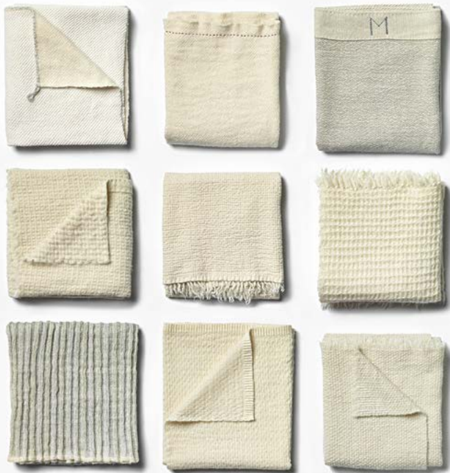
Fig. 6. Infant-wrapping cloth, handwoven, 2011.

of metaphors related to weaving. The prophet Isaiah wrote about death in the following way: