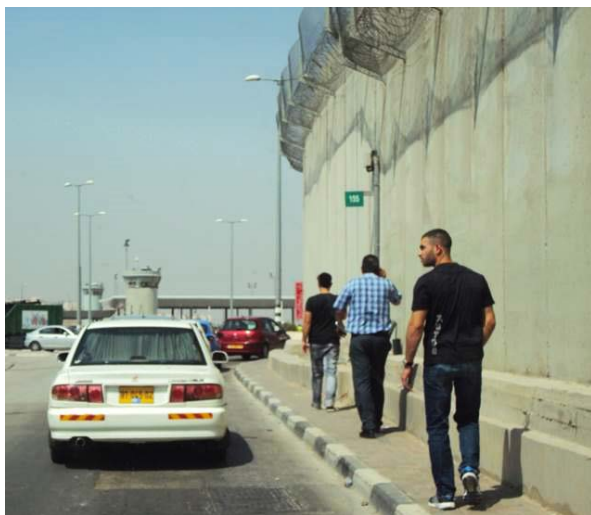
West Bank Barrier surrounds Ramallah and makes it difficult for Palestinians to move around.

2008: 103). In this article I will discuss the utilisation of prayer and prayer types as coping devices during the life course from young adulthood to old age in the midst of a context of conflict.