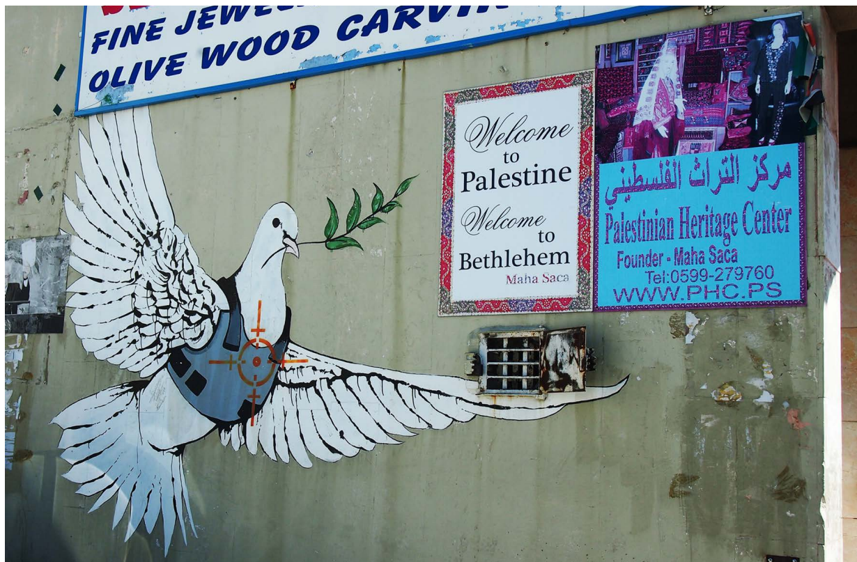
Graffiti done by Banksy greets people in Bethlehem.

The Protestants thus were over represented. This may be due to familiarity with and trust of the