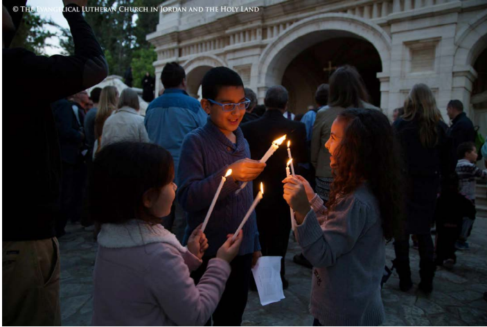
Easter worship at the Mount of Olives.

self as a spiritual person rather than religious, thus thanksgiving is practising his spirituality and it is the core of his faith: