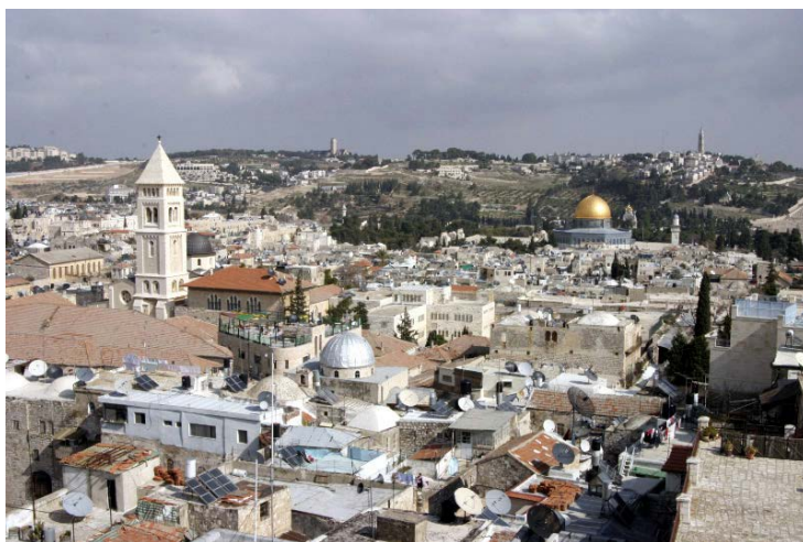
Jerusalem is a holy city for the three Abrahamic religions: Christianity, Judaism and Islam.