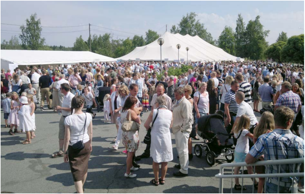
Spring service in Bosund, Larsmo 2011.