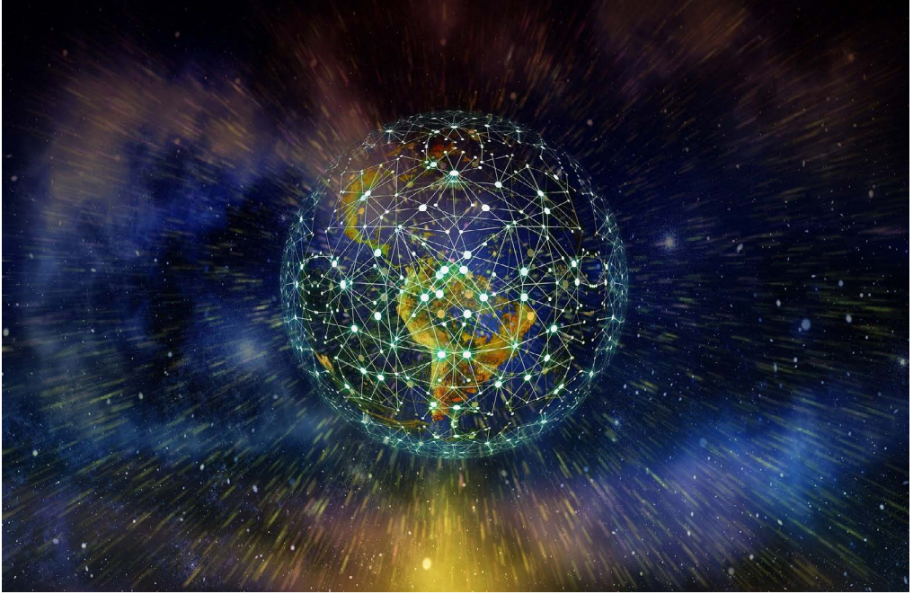
The interconnectedness of life.

taking note of the inherent central values in the statements presented in the discussion about COVID-19. 17 My aim with the analysis is to show what such an ethical framework makes visible in this particular example.