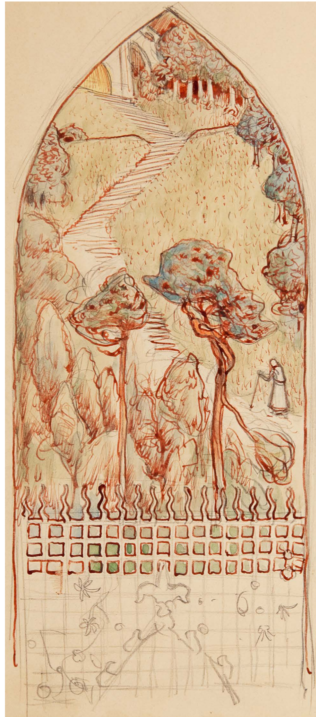
Akseli Gallen-Kallela, Gate of Paradise , 1902, water-colour and pencil, 26 x 10.5 cm (sketch 98-M55). Sigrid Jusélius Foundation, Helsinki.

Similar conceptions can be found, for example, in the writings of Arman Point (1861–1932), a regular artist at Péladan's Salon de la Rose+Croix. In 1896, Point