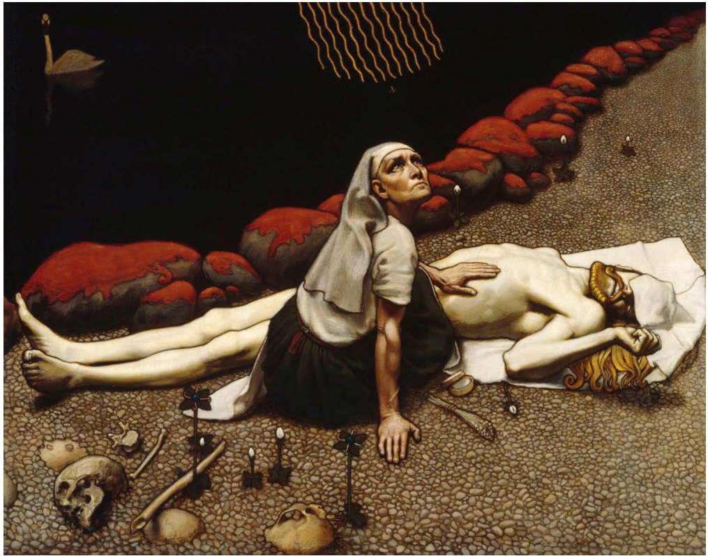
Akseli Gallen-Kallela, Lemminkäinen's Mother, 1896, tempera on canvas, 85.5 × 108.5 cm. Ateneum Art Museum, Helsinki.