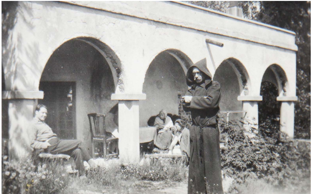
Akseli Gallen-Kallela in a monk's robe, 1928, photograph by Kirsti Gallen-Kallela, 56 x 85 mm. Gallen-Kallela Museum, Espoo.

these intellectuals, critical of the Church and in search of a new perspective on religion were called 'metaphysical wanderers' and 'occult seekers.' They were depicted as individuals drifting between religious alternatives, remaining open to the various views (often connected with esotericism) but ultimately not subscribing to any of them. 2