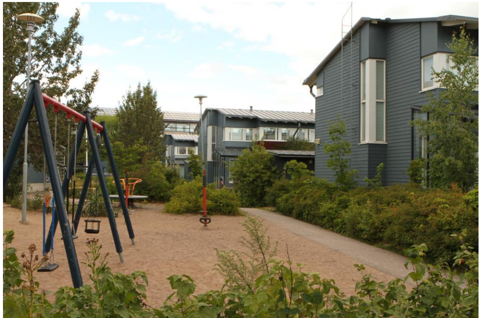
Figure 1. Wooden houses in Viikki eco-district in Helsinki.

basis to a performance-based design basis (Ramage, et al., 2017). For example, in Finland, changes in fire regulations have allowed the use of wood in building frames and façades up to four storeys since 1997, and up to eight storeys since 2011 under standardized conditions (Puuinfo, 2018b), while the eight-storey limit does not apply in the case of individual fire performance analysis. Furthermore, the increasing use of wood in buildings may be encouraged by new environmental policies for the built environment. For example, some cities with carbon neutrality objectives (e.g. Copenhagen, Helsinki, Seattle and Vancouver) support the use of wood as a building material or as fuel. Helsinki municipality has recently made the use of wood materials in the new buildings of Honkasuo district mandatory. This decision was legitimized by the Finnish Supreme Court in 2015 based on the Land Use and Building Act 132/1999 of the Ministry of the Environment, which allows municipalities to supervise and approve plans and projects, including the possibility to introduce design constraints (e.g. the use of specific materials) in urban regulations (Franzini, et al., 2018). However, to underpin the role of wood products in sustainable buildings, there is a need to increase debate (amongst stakeholders) so as to inform future practices and policies in the building sector.