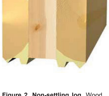
Figure 2. Non-settling log. Wood shrinks only in direction perpendicular to grain, and in here the vertical layer of wood in the middle prevents shrinking.

One characteristic feature of log building is settling. Wood is a hygroscopic material, which means it will gain or lose moisture from the air, and this causes wood to expand or contract according to humidity changes in surrounding environment (Meier 2016). Thus, a building frame consisting of horizontally laid logs settle during time as the logs shrink when they dry out. Because wood is