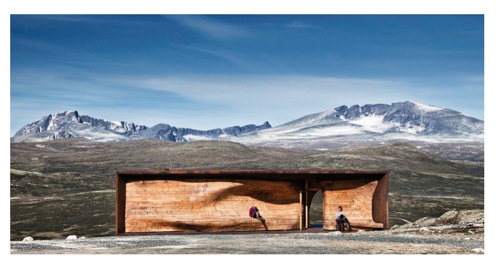
Figure 12. Free shaped log structure is visible in the façades of Norwegian Wild Reindeer Center Pavilion.

The versatility of log material is manifested in these two examples. In addition to structurally bearing components logs can be used to generate also parts that have other functions, as described above. Wood is known to be versatile, but the notion that logs of a log house can also be used in providing necessary furniture, fixtures etc. as an integral part of the log structure is something rather untraditional and novel in the context of log building.