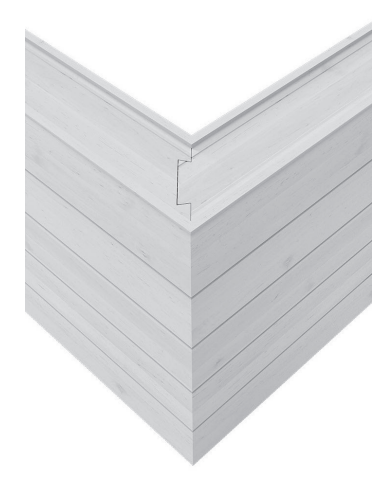
Figure 4. Corner of log walls with a hidden dovetail joint.

reveal and emphasize the construction technique as well as wall's thickness. Hidden dovetail joint also enables the log courses to be even instead of the traditional half-lapping courses. Thus, when hidden dovetail joint is utilized, log buildings that don't appear as log buildings – by orthodox definition – are created.