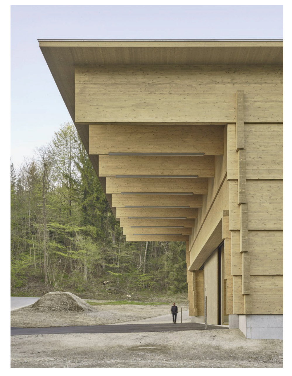
Figure 13. Workshop AWEL

In Workshop AWEL basically the only thing that separates the building from a traditional shed is the size – and not the size of the building alone, but especially the size of the utilized wooden elements, the so-called logs. They are over thirty meters long and approximately two meters high glue-lam beams, see figure 13. Workshop hall shows that industrially produced logs can definitely differ a lot from original logs in terms of dimensions and still utilize the construction principles of a log construction.