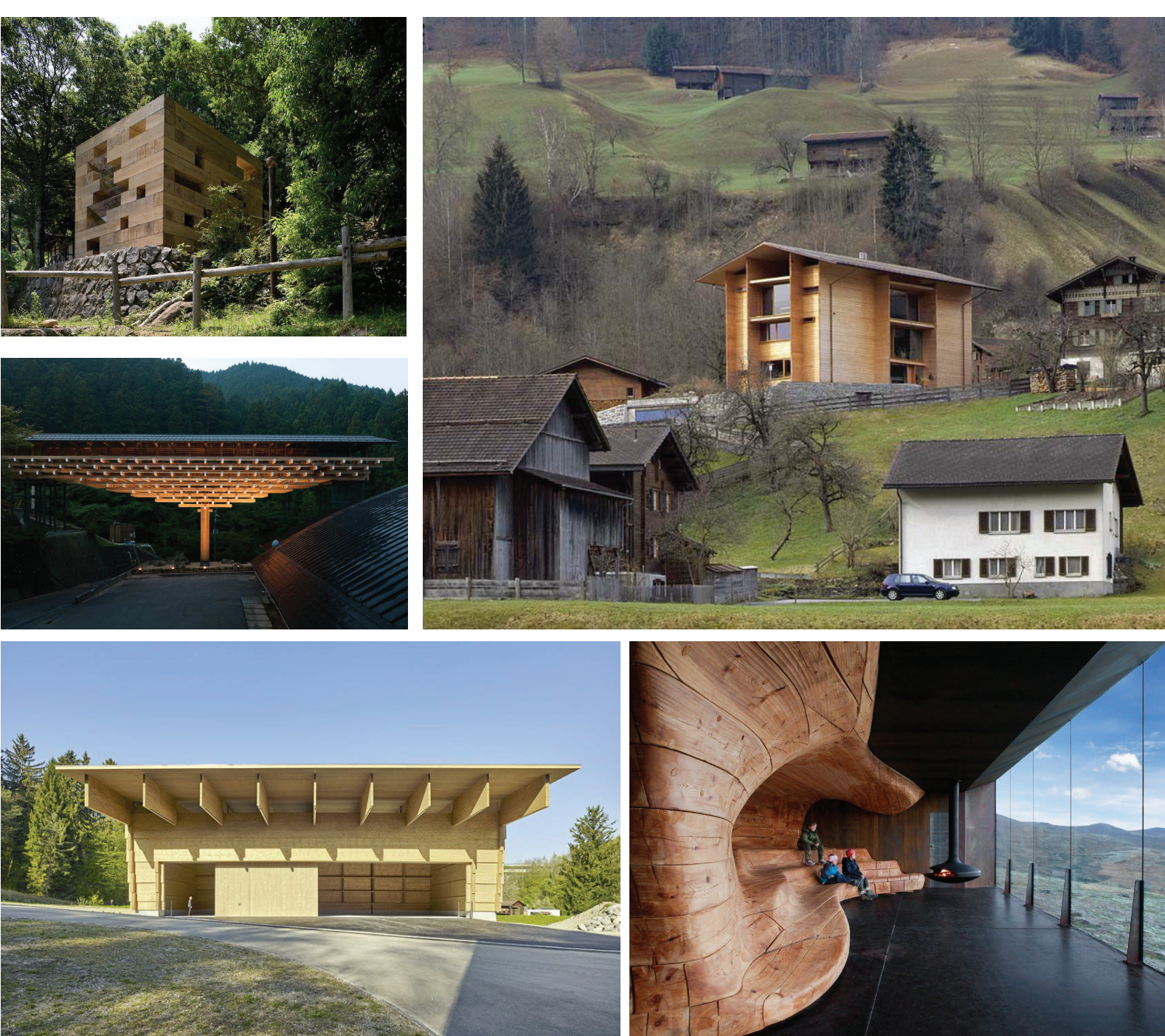
From top left: Figure 5. Final Wooden House. Figure 6. Haus Luzi. Figure 7. Yusuhara Wooden Bridge Museum. Figure 8. Workshop AWEL.. Figure 9. Norwegian Wild Reindeer Center Pavilion..

*Some examples were published in multiple sources, but each of these is included in total sum only once.