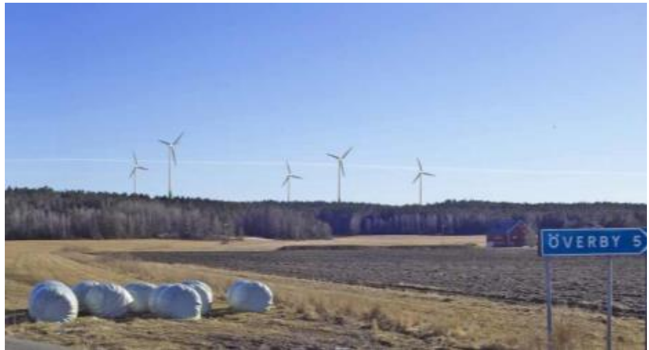
Figure 6. A photomontage over the five wind turbines planned at Lursång.

the possibilities of compensating the impact. The public and authority consultation and design of the individual wind farm runs parallel with the proceeding wind power plan. Therefore, the experiences of the consultations in the individual project merge into the larger process in which the municipality operates. Compensation measures for impact on cultural heritage were therefore later included in the adopted wind power plan.