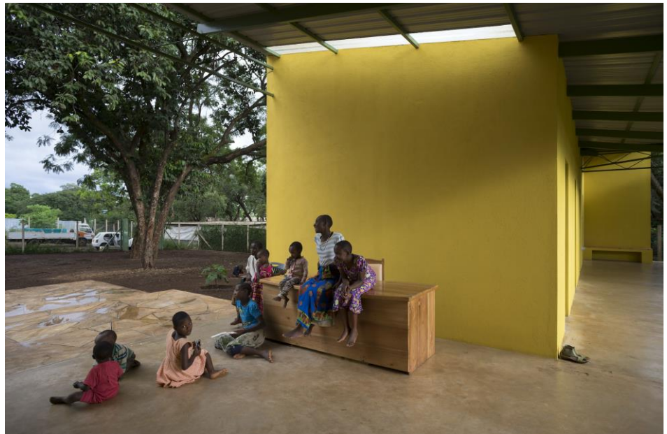
Figure 3. The KWIECO Shelter House, Moshi, Tanzania. Executed in 2016.

Ukumbi's projects to date could only be completed through trial and error. Conditions may differ from Cambodia to Egypt (Figure 4), from Tanzania (Figure 3) to Senegal, but the attitude of the dedicated architect remains the same. When one's work, as well as its means, aim to promote people's sense of self, even an architect flown in to assist must be humble. That humility must be founded on secure confidence in one's own competence. There is a great deal of professional expertise to be gained from Ukumbi's experiences but more importantly a valuable perspective as well.