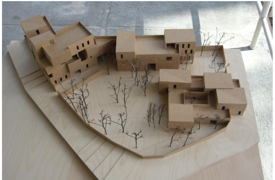
Figure 4. A model of the APE Learning Centre in Cairo, Egypt.

We would like to thank Rasmus Wærn for his analytical comments and support during the writing process as well as Guillermo Fernandez-Abascal for letting us use the Political compass as an illustration.