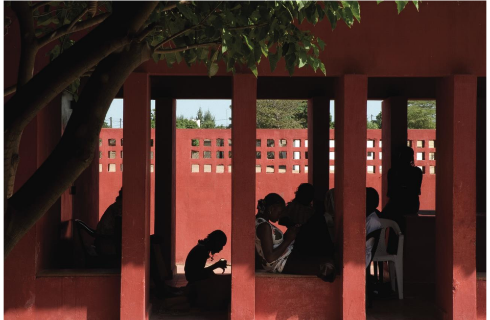
Figure 2. The Women's Centre in Rufisque, Senegal. Executed in 2001.

The explanation seems quite relevant, particularly as it contains several familiar components, such as the fundraising and grant aspect, as well as the connection to academic research. It is intriguing to see the work of Hollmén Reuter Sandman in this broader context.