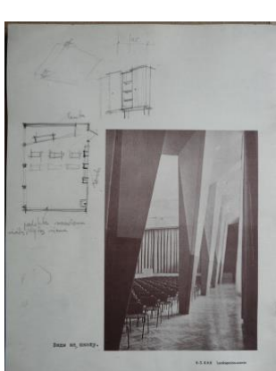
Figure 1. Flyers and brochures from trips to Finland in the 1960s, private collection of V. E. Čekanauskas