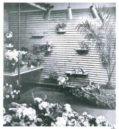
Figure 4. Justinas Šeibokas, Interior of the Flower Pavilion in Vilnius, 1961, private collection of J. Šeibokas

a bar, and large and small halls, all finished in new, modernist forms and different natural materials (wood, metal, ornamental plastering and glass). The creative process combined the Nasvytis brothers' knowledge of folk art (with inspiration from pre-war Kaunas café culture) and an understanding of the spirit of Alvar Aalto (still the pre-war Aalto, Villa Mairea for example, perceived only from architectural journals). The architects succeeded in combining modern aesthetics with a national Lithuanian narrative, embodying a concept that showcased a new elite style.