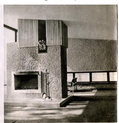
Figures 6a and 6b. Interior of the Composer's Hall of Music was featured in the Czech design magazine Domov, 1968, No. 2, pp. 47-48