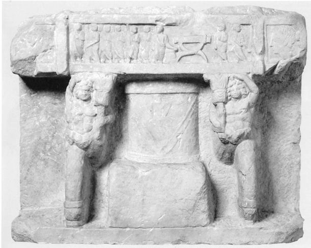
Fig 1: Funerary monument with a sella curulis . Museo Nazionale Romano, Palazzo Massimo alle Terme, inv. 124483.

The symbolic value of the sella curulis appeared to some degree self-evident to Roman observers. For instance, in a relief block possibly from a funerary monument from via Labicana (figs. 1 and 2), the role of the magistrate is communicated only with the chair and capsa , the container for documents. The relief itself is in the shape of a sella curulis . Between the legs of the chair is the capsa , but above the seat there is a panel with a smaller relief. At the centre of this relief is a togatus , presumably the magistrate, and beside him on the other side a gigantic sella curulis , roughly twice the actual size, and on the other side a