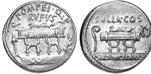
Fig. 2: Denarius of Q. Pompeius Rufus, Rome, 54 BC, with sella curulis on both sides. Crawford 434/2.

group of lictors. 28 If there is a way to centralize the sella curulis more, it would be difficult to imagine.