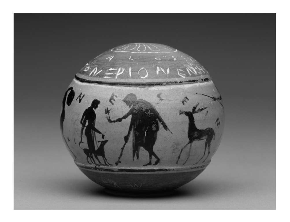
Fig. 3. Ball depicting palaistra scenes (central field): boy and elderly man.

served a slightly derisive purpose, as if the figure in question resembled someone "from the tombs", or indeed was like a corpse "from the graves". The youthful figures are all customarily beautiful and athletic (see below), but a jeering comment like this might have been made with some sense of malicious humour in mind. We observe that Margherita Guarducci arrived at a similar conclusion when reconsidering her earlier adhesion to Immerwahr's hypothesis. <sup>17</sup> She did not discuss the ἐκ τον ἐρίον evidence at all, but had intuitive doubts about any connection with funeral games ("debbo ammettere che il passaggio dal significato di "tombe" a quello di "ludi sepolcrali" è decisamente troppo audace", p. 13). Even if the address of the anonymous comment can hardly be established with certainty, our impression is that Guarducci was basically right in her explanation of the text, which was accompanied by a translation with fitting comment: "(il fanciullo bello), che sembra venuto dal cimitero"; quasi a dire: "Altro che bello! Egli è un mezzo morto, il fantasma di un morto" (p. 15). As far as may be gathered from the entry CAVI no. 2809, although referring to Guarducci's hypothesis ("differently Guarducci"), Immerwahr continued to prefer his original interpretation.