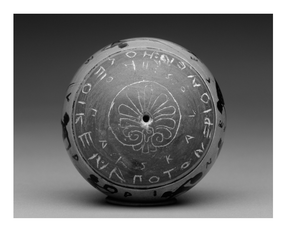
Fig. 4. Ball depicting palaistra scenes (top cap): graffiti.

One may add that both Immerwahr and Guarducci referred to an interesting topographical detail preserved in Etym. Magn. s. v. Ἡριά: Αἱ πύλαι Ἀθήνῃσι· διὰ τὸ τοὺς νεκροὺς ἐκφέρεσθαι ἐκεῖ ἐπὶ τὰ ἠρία, ὅ ἐστι τάφους. <sup>18</sup> It has been assumed long since that this "Gate of the Graves" led to an archaic cemetery northeast of the Dipylon, and thus close to the Kerameikos with a concentration of pottery production. If so, one may wonder if the clay ball was manufactured in a workshop situated in this district, the commentator also playfully alluding with the phrase ἀπὸ τον ἐρίον to a local toponym.