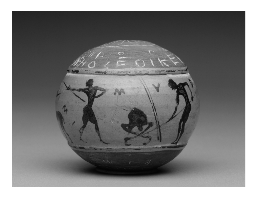
Fig. 2. Ball depicting palaistra scenes (central field): javelin-throwers.

he looks as he comes from the [games at the] funeral". <sup>14</sup> That a winning athlete returning from festivals may appear handsome makes perfect sense, but as we saw, \dot{\epsilon}\rho\dot{\alpha} should mean 'grave monuments' or tombs in general, and not contests of any kind. A further problem is that the text may end with EN, the first A (in \dot{\epsilon}v\alpha\iota\{\alpha\iota\} ) looking less like a letter and the second one being considerably dislocated, and it is difficult, moreover, to discern any traces of the two iotas (Fig. 4).