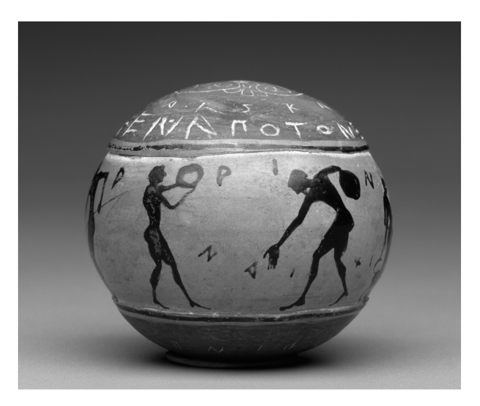
Fig. 1. Ball depicting palaistra scenes (central field): discus-throwers.

astic courtship scenes featuring gifts. While similar objects in clay imitating a toy ball have been found on Samothrace and Thasos in Hellenistic burials, the erotic scene, in particular, might have been considered more suitable for a hetaira than a young girl. Even so, it was deemed suitable to add an emphatic " \nu\alpha i \chi ı" (Fig. 1) after "Μυρρίνες εἰμί" (see below) – perhaps adding humour, or at least an acknowledgment that such artefacts with such decoration were not made for women on a regular basis.