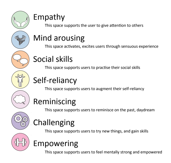
Figure 3. Seven spatial design missions to design for SWB

The seven SWB spatial design missions (see figure 3) give clear directions, but are vague enough to not interfere with designerly creativity. In that respect, the seven spatial design missions can be used as an assistence in the design of and the review of RCCs.