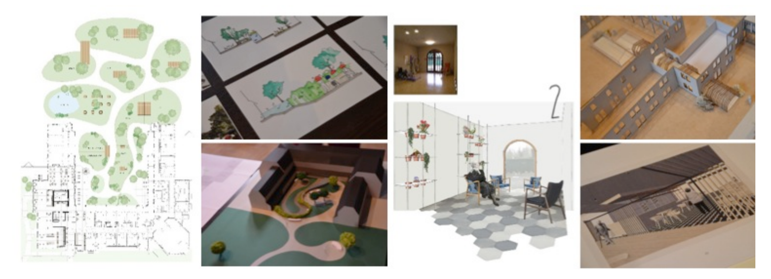
Figure 4. Images of design results From left to right: design case 1, 2, 3 and 4.

In this section, we will discuss four design cases from this design exercise. We opted to report on four cases since they have a great variety in concept and design outcome, and all provided us with new and unique ways of carrying in them the modified PERMA parameters. In this phase we try to capture the spatial options students have applied to tackle this design for SWB challenge, and we fill in the spatial affordances created for each modified PERMA parameter, which is shown in the table below the case description. In this way, we transform modified PERMA parameters which are human 'abilities', into spatial 'affordances'. The latter being a more suitable worktool for designers. In figure 4 below, an image per design case is given.