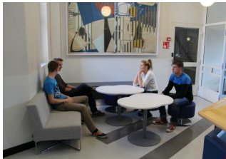
Figure 7. Hallway corner after the redesign.