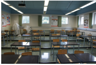
Figure 1. A classroom before the changes.

possible transferability, or applicability, of the methods to both similar and other cultural contexts such as the USA. To conclude, we will also propose some procedural design principles for involving learners in the design of LE conducive to learning and wellbeing.