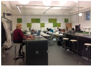
Figure 6. Classroom seen from the sliding glass doors after the redesign.

A total of 83 students completed the survey, mostly while having classes in the renewed premises. In addition to the survey, video analysis, observations, and short teacher interviews were used for determining the actual use of the redesigned spaces. Further, internal (e.g., school directors, teachers, teacher students, students) and external (e.g., researchers, research coordinators) stakeholders were interviewed as a part of a case study and video-material produced by the European Key Competence Network on School Education (see e.g., Mäkelä et al., 2013), thus producing material both for the impact evaluation and future evaluation of the transferability.