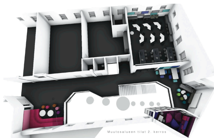
Figure 5: Professional interior design, general view. With the permission of the Interior designer Liisa Lundell, Architects LPV Jyväskylä Oy.

4. Evaluating the professional design: Before implementing the changes, participants of the co-design project course were invited to evaluate the professional design (see Figure 5) from students' perspectives. Two male students attended the session conducted by two researchers. The interior designer in charge of the redesign was invited to this session but was obliged to cancel the meeting at the last minute. Summarized feedback was thus sent to her by email.