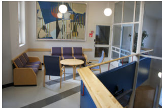
Figure 2. A hallway corner and the interior balcony before the changes.