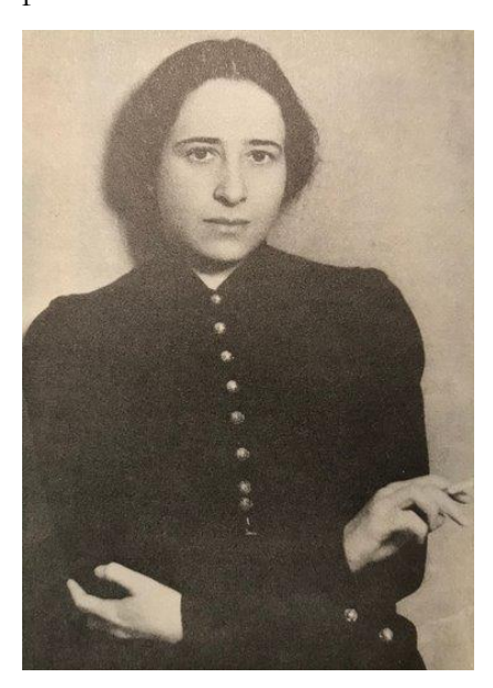
Hannah Arendt (1933).

It is an older distinction that has retained its validity. It helps to recognize what remains politically virulent and imperfect. And it is necessary to remind the concrete politics of power of its forgotten yardstick. We cannot, of course, reduce the political to the ethical. But there are normative-ethical standards by which the political is reflected. The persuasiveness of the normative standard remains vital: Hannah Arendt spoke of the activities of self-preservation that remained separate from the realm of freedom. On the one hand there was the realm of necessity, the Greek oikos . Here politic is shaped by the constraints of economy and rule. On the other hand, we (still) recognize the idea of the polis, a figure from the realm of freedom. When citizens gather in spaces and seek a common answer to the most pressing questions of their community, this ideal comes close. This common practice is fragile, as Hannah Arendt knew. The free practice of the many always disintegrates – historically speaking – as soon as political provisions come into force.