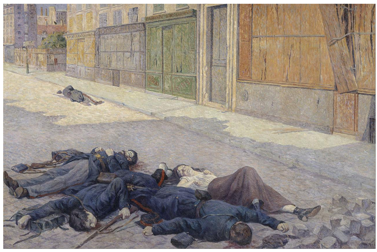
Maximilien Luce: Une rue de Paris en mai 1871. Oil on canvas, between 1903 and 1906.

in the sign of the other<sup>26</sup>. This, of course, is not only possible in Europe, as if the philosophical path had been outlined here, which all lost philosophical wanderers would eventually have to follow. But Europe stands, one might regard this as the typical stumbling passage of history, at a historical, social, spatial and political landmark. To explain this is the common task – and to explain why self-centering is advisable in this case to prevent the final self-reference.