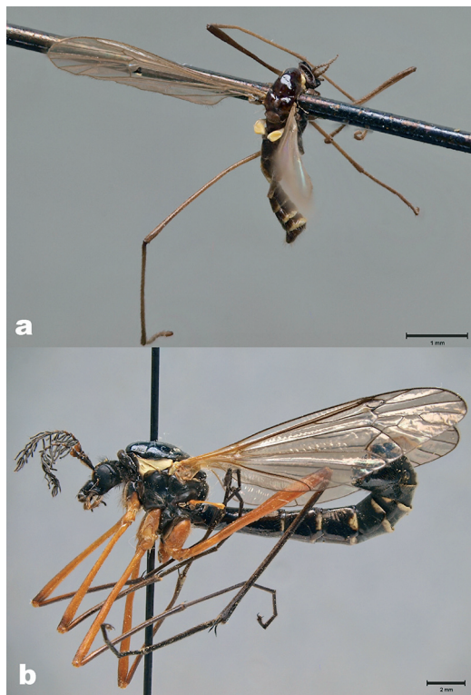
Fig. 1. – a. Symplecta lindrothi (Tjeder, 1955). Adult male, habitus photo. Finland, Ab: Karjalohja, R. Frey leg. (MZH). This specimen was identified by Lundström (1912) as Symplecta meigeni (Zetterstedt). Symplecta lindrothi is so far only known from Finland and Sweden. – b. Ctenophora guttata Meigen, 1818. Adult male, habitus photo. Finland, Ab: Lohja, J. Kahanpää leg. 2005 (ZMUT).

fest fruiting bodies of fungi (Alexander 1920, Brindle 1967) and cylindrotomid larvae are herbivorous, feeding on mosses or higher plants (Peus 1952). Adults have non-biting mouthparts but they may suck plant nectar or other liquids (Alexander 1920). Crane flies may occur abundantly in the boreal and arctic biomes (Chernov & Lantsov 1992) thus comprising an important component of food-webs (e.g. MacLean 1973). The majority of crane flies are “harmless” and inconspicuous. Only larvae of Tipula ( Tipula ) spp. and Nephrotoma spp. are known to cause economic loss in pastures or cultivated fields (Oosterbroek 1978, Blackshaw & Coll 1999).