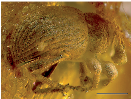
Fig. 1. Lateral (right) view of Archaeocallirhopalus alekseevi sp. n. (holotype). Scale bar = 1 mm.

ited in ACAB. Paratype: no. BA2012/13, female, deposited in ISEA.