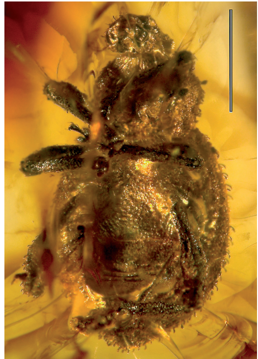
Fig. 5. Ventral view of Archaeocallirhopalus alekseevi sp. n. (paratype). Scale bar = 1 mm.

Abdomen. Abdomen flattened in middle; metaventral process as wide as transverse diameter of metacoxa; 1 st and 2 nd ventrites elongate, equal in length; 1 st ventrite 1.2 times as long as