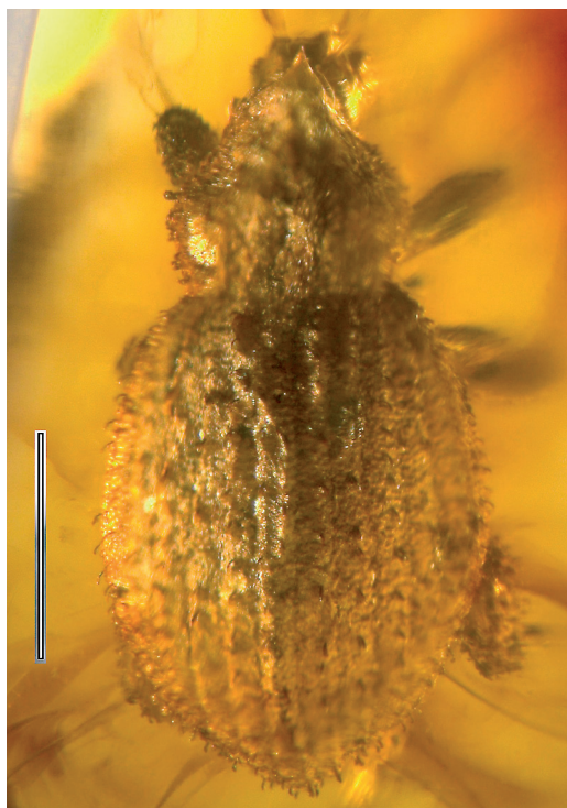
Fig. 3. Dorsal view of Archaeocallirhopalus alekseevi sp. n. (paratype). Scale bar = 1 mm.