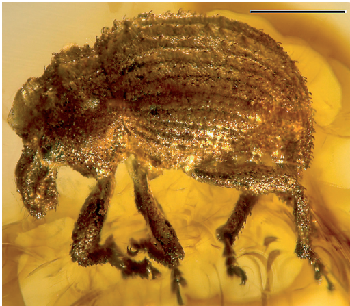
Fig. 4. Lateral (left) view of Archaeocallirhopalus alekseevi sp. n. (paratype). Scale bar = 1 mm.

1.4 times longer than wide, 0.5 times as long and 0.9 times as wide as 2 nd antennomere; 4 th – 6 th antennomeres subequal to 3 rd antennomere; 7 th antennomere 1.3 times longer than wide, almost equal in length and 1.1 times as long as 6 th antennomere; club compact, 0.4 times as long as flagellum, 1.8 times longer than wide, with fused antennomeres, weakly acuminate.