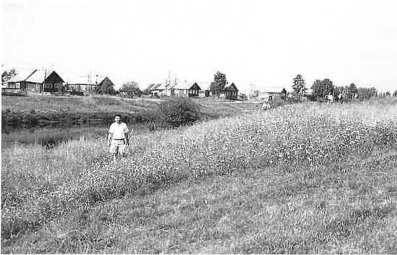
Fig 1. Grassland on the bank of the River Olonka in Olonets. Three Centaurea species including C. phrygia are very abundant here.