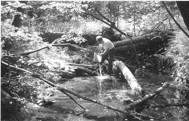
Fig. 2. Luxuriant grass-herb primeval forest in the conservation area of Nizhnie-Svir in Gumberitza, Olonets. Dominant trees are Tilia cordata , Acer platanoides , Populus tremula and (fallen trunks) Picea abies . (Photo: R. Iivarinen).

Ornithological station, Dr. Viktor Kovalev.