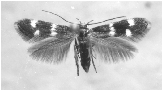
Fig. 1. Elachista leifi Kaila & Kerppola female (Finland KemLE: Pelkosenniemi 7452:532, 03.VII.1995, J. Itämies leg.).