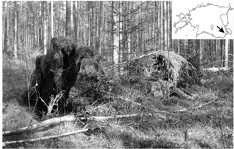
Fig. 1. Collecting locality near Piusa, south-east Estonia.

munication is to present the first European record of E. inaperta , to diagnose the species and to discuss its difference from E. exigua . Diagnostic characters are based on those found in male terminalia only.