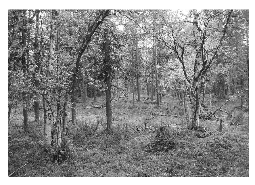
Fig. 2. Habitat of Euplectus lapponicus sp. n. in Lemmenjoki National Park, Allivuotso.

elytral-mid-length, hardly visible in dorsal view, distinct in oblique view. Metathoracic wings fully developed, functional. Abdominal tergites 1 and 2 with discal carinae diverging apically, extended somewhat behind respective tergal mid-length, at bases separated by intervals about as large as fifth of basal width of tergum. Following tergites lacking discal carinae.