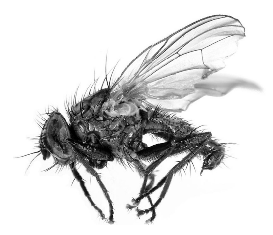
Fig. 1. Fannia conspecta male, lateral view.

Czech Republic: CZ: Bílina – Jirásek III, MT/ / Phragmitetum, 310 m, 1998// 50°33`35``N, 13°47`44``E// leg. Barták, 14.v.–23.vii.