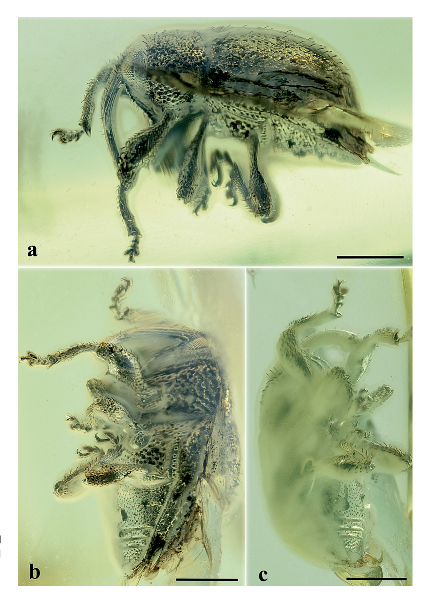
Fig. 1. Dorytomus groehni sp. n. , habitus of holotype. – a. Lateral view. – b. Ventro-lateral view. – c. Ventral view. Scale bars 1 mm.

than diameter of one puncture, interspaces rugose and with microreticulation. Prothorax apparently without medial furrow for rostrum reception. Precoxal portion of prothorax elongate, about as long as diameter of procoxa; postcoxal portion of prothorax short, about 0.4× as long as diameter of procoxa.